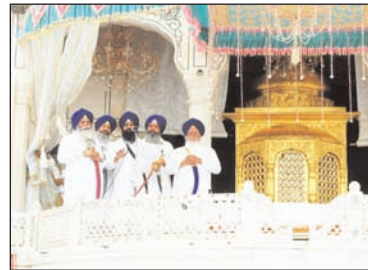
Sahib in Patna) as "tankhaiya"