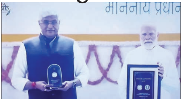
Akhand Bharat Sandesh

Prayagraj. On the occasion of the 150th anniversary of the national anthem Vande Mataram, composed by nationalist pioneer Bankim Chandra Chatterjee in 1875, the Prime Minister and Chief Minister's program was broadcast live