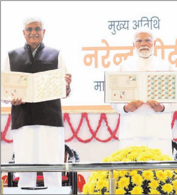
PM at the inauguration of the year-long commemoration of 150 years of the National Song “Vande Mataram” at the Indira Gandhi Indoor Stadium, in New Delhi on November 07, 2025.

Kharge also drew a contrast with Congress traditions, noting that Vande Mataram has been part of every party meeting and event since 1986. “The Congress Party takes immense pride in both Vande Mataram and Jana Gana Mana.