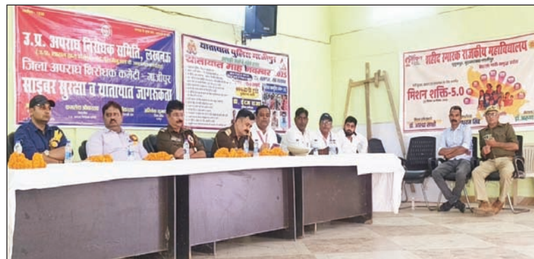
Akhand Bharat Sandesh