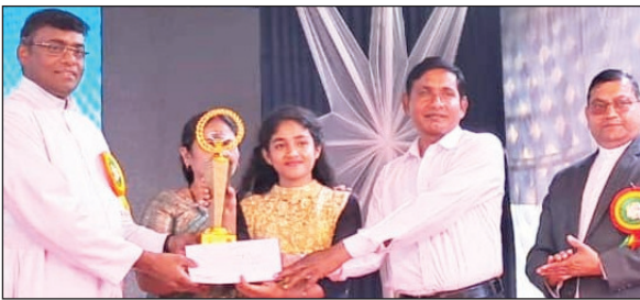
Akhand Bharat Sandesh