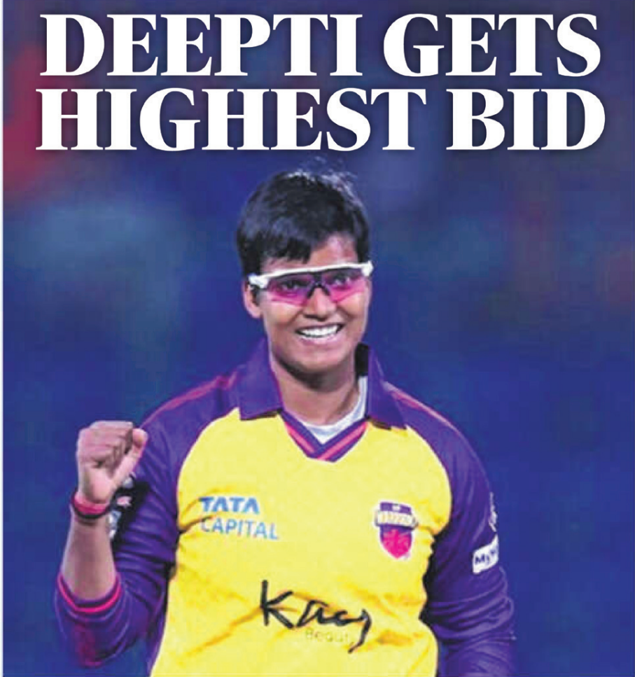
UP Warriorz used the Right to Match card to secure services of Indian all-rounder Deepti Sharma for ₹3.20cr in the WPL 2026 mega auction in New Delhi on Thursday. x

UP Warriorz surprisingly shelled out ₹2.40 crore for the veteran India all-rounder Shikha Pandey, who last played for the national side in 2023.