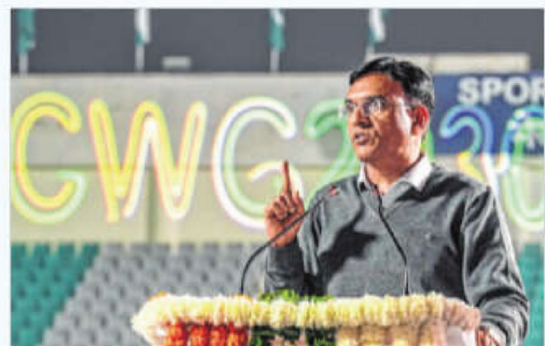
Union Sports and Youth Affairs Minister Mansukh Mandaviya speaks to the media in New Delhi.