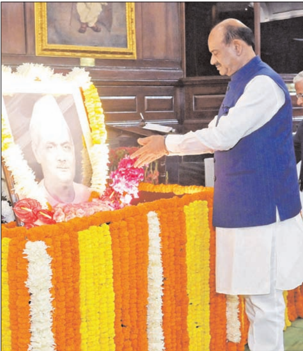
Lok Sabha Speaker Om Birla paid tribute to the first Speaker of the Lok Sabha, G.V. Mavalankar