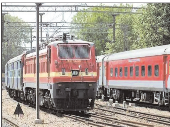
DJB served with a notice by NGT

Delhi: Indian Railways will compile the reservation chart 8 hours before the train's departure, up from 4 hours, to improve passenger convenience. This adjustment aims to reduce passenger uncertainty, especially for waitlisted tickets. Railway Minister Ashwini Vaishnaw evaluated ticket booking reform efforts before making the decision. He said the ticketing process should be smart, transparent, and efficient, prioritizing passenger comfort. The reservation chart will be prepared at 9 p.m. the night before for trains departing before 2 p.m. A gradual implementation will provide a smooth transition without disturbance. Travelers from outlying places or suburbs of big cities will benefit from additional time to check their ticket status and make alternate travel plans. Waitlist passengers will receive early ticket confirmation updates, making their