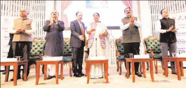
oped through a joint effort by the National Informatics Centre (NIC) and the Delhi