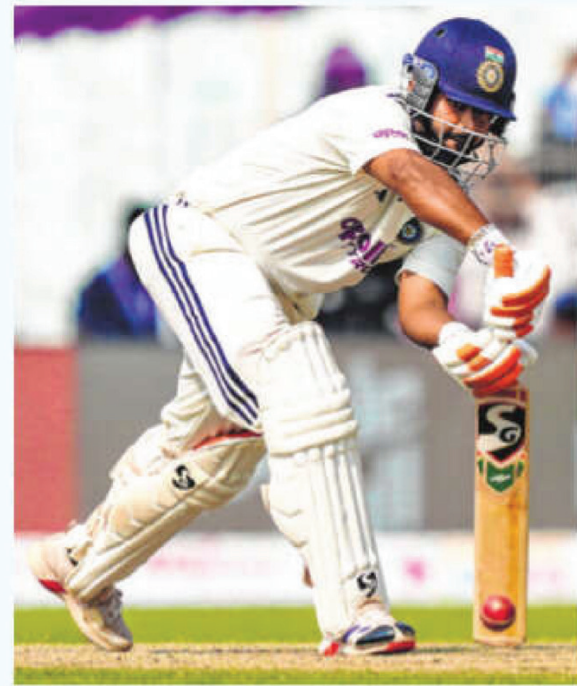
India's vice captain Rishabh Pant plays a shot during the third day of the first Test.

"A score of 120 can be tricky on these surfaces. But having said that, we should have been able to soak in the pressure and capitalise. We haven't