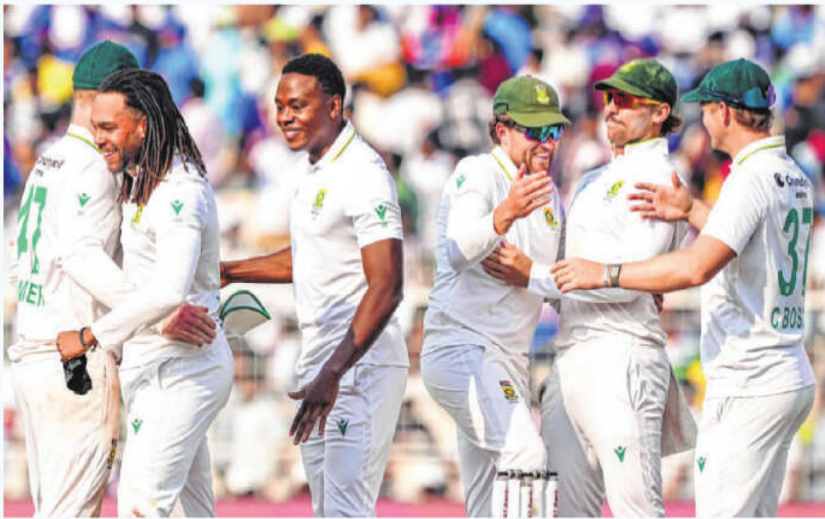
South African players celebrate after the team's victory during the third day of the first Test.

Washington Sundar (31 off 92) and Jadeja (18 off 26) gave India hope in the run chase as