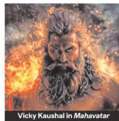
Vicky Kaushal in Mahavatar

As per reports, Vicky Kaushal to quit non-veg food and alcohol for Amar Kaushik's Mahavatar