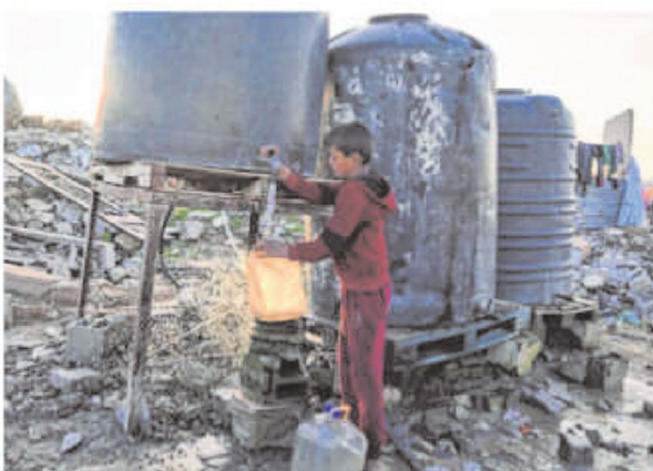
A Palestinian boy collects water from a tank amid the rubble of destroyed buildings in Gaza City.

Foreign ministers of 10 nations expressed "serious concerns" about a "renewed deterioration of the humanitarian situation" in the devastated territory, saying the situation was "catastrophic".