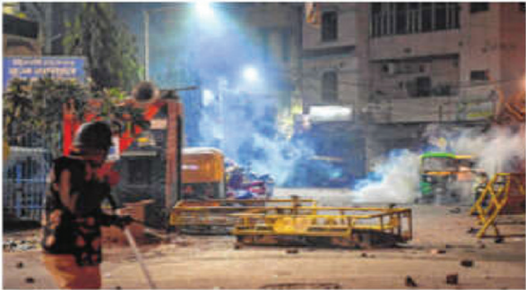
A security official keeps vigil at a vandalised site after violence erupted in Ramliia Maidan area, in New Delhi, early Wednesday

The incident occurred around 12:40 am when the crowd, despite prohibitory orders, gathered near Turkman Gate and began raising slogans against the