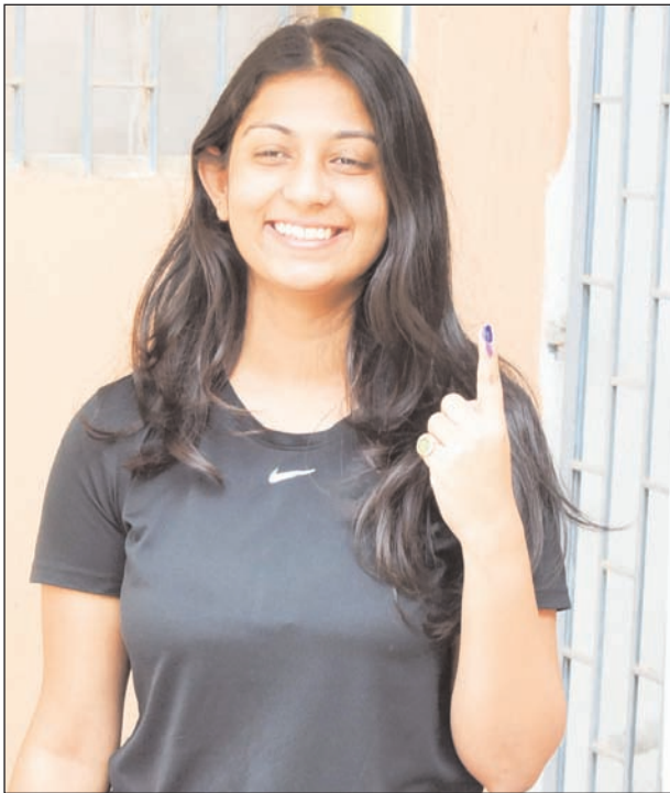
A woman voter shows the indelible ink mark after casting her vote, at a polling booth during the first phase of Bihar Assembly Elections, at Samudayik Bhawan, in Patna.

live webcasting of polling in 100% of the polling stations, with chief election commissioner Gyanesh Kumar and election commissioners S S Sandhu and Vivek Joshi monitoring the feed from the EC control room here. The CEC engaged with the presiding officers and district election officers from the control room to ensure the smooth progress of polling. Another first in this election was the visit of 16 foreign delegates from six countries to Bihar as part of the international election visitors' programme (IEVP), to witness the poll proceedings. The delegates, EC said, hailed the Bihar elections for being one of the most well-organised, transparent, efficient and participative elections, internationally. Over 90,000 'jeevika didis' or female volunteers were deployed.