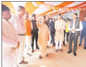
(November 7). After attending religious programs earlier in the day, the Chief

Chief Minister Yogi Adityanath, on the second day of his Varanasi visit on Thursday, inspected preparations at Banaras Railway Station for Prime Minister Narendra Modi upcoming two-day tour to his visit parliamentary constituency, starting from Friday