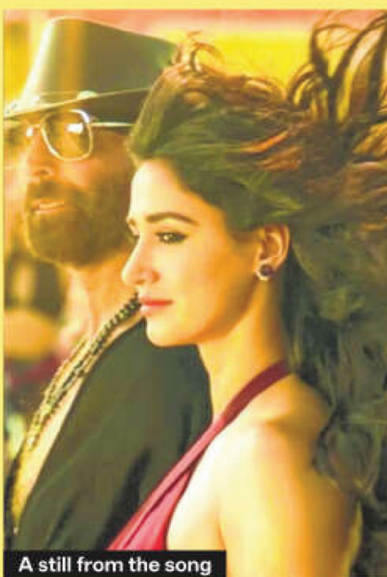
A still from the song

D earest readers of the ton, Jonathan Bailey, best known for his role as Lord Anthony Bridgerton in Bridgerton , has officially been named PEOPLE's Sexiest Man Alive 2025. The announcement marks the 40th anniversary of the iconic franchise, placing Bailey among Hollywood's most charming and admired men. Fans across the globe couldn't help but cheer as the British actor joined this elite list.