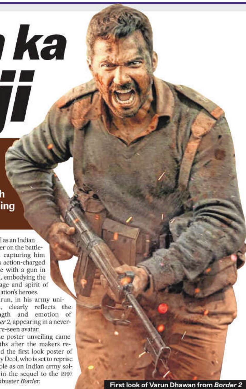
First look of Varun Dhawan from Border 2

The poster unveiling came months after the makers released the first look poster of Sunny Deol, who is set to reprise his role as an Indian army soldier in the sequel to the 1997 blockbuster Border .