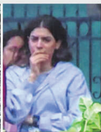
The leaked photos from the film's sets went viral on social media