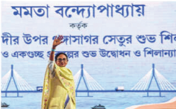
West Bengal CM Mamata Banerjee during laying of the foundation stone for the 'Gangasagar Setu', a 5-km-long bridge over Muriganga river to connect Sagar Island, in South 24 Parganas district of West Bengal on Monday

"Post SIR exercise, the way TMC had conducted the elec-