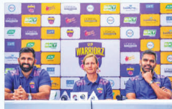
UP Warriorz captain Meg Lanning, centre, during a press conference.

India opener Shafali Verma, who played a crucial knock in the final to guide India to their maiden World Cup title, remains a key figure for DC after being retained ahead of the 2026 auction.