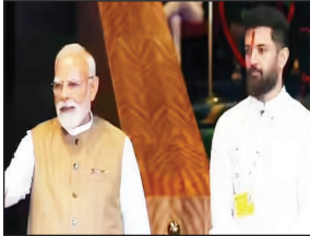
Shahabad region and key districts such as Patna, Bhojpur, Saran and Siwan. 'NDA Will Form Govt Again Under Nitish Kumar's Leadership': Bihar

NEW DELHI: NDA is banking on its reinforced alliance and the appeal of its welfare measures in regions going to polls in Bihar on Thursday to turn the tide in its favour in areas where the Mahagathbandhan (MGB) had edged past it in the last assembly election. In 2020, RJD-led opposition had won 61 of the 121 seats that go to polls in the first phase, against NDA's 59, performing strongly in