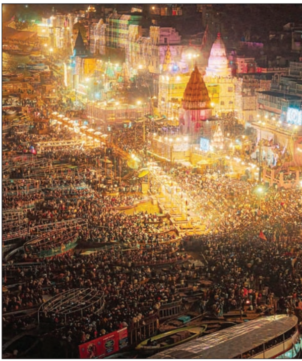
Faith shimmered from the embrace of Mother Ganga as the crescent-shaped ghats of Kashi glowed with millions of lamps on the sacred occasion of Dev Deepawali.