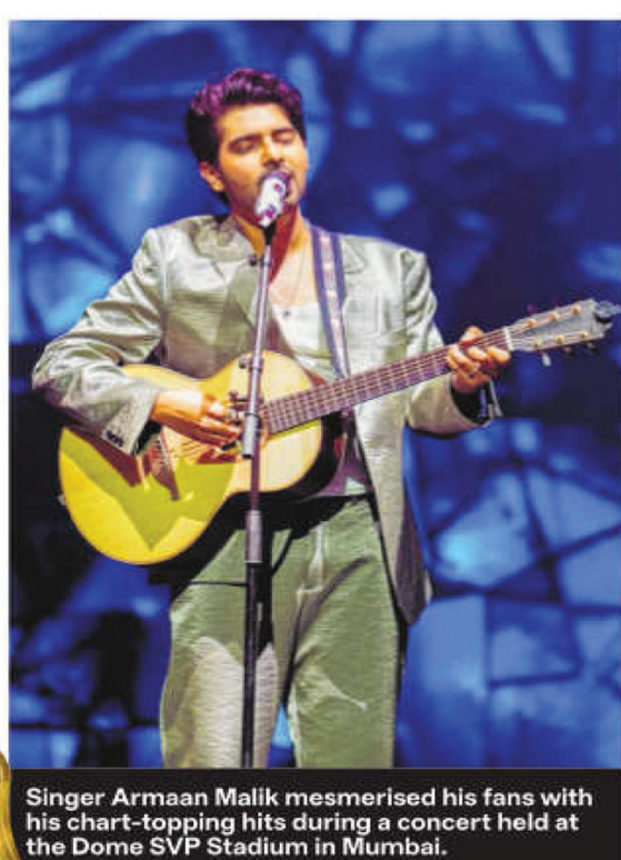
Singer Armaan Malik mesmerised his fans with his chart-topping hits during a concert held at the Dome SVP Stadium in Mumbai.