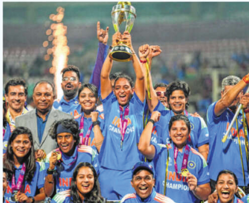
India's captain Harmanpreet Kaur (centre), lifts the trophy as team members and others celebrate after winning ICC Women's World Cup 2025, at the DY Patil Stadium, in Navi Mumbai.

None of it came easy but Harmanpreet said she wasn't the one to get bogged down