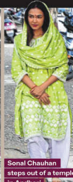
Sonal Chauhan steps out of a temple in Andheri