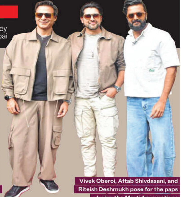
Vivek Oberoi, Aftab Shivdasani, and Riteish Deshmukh pose for the paps during the Masti 4 promotions