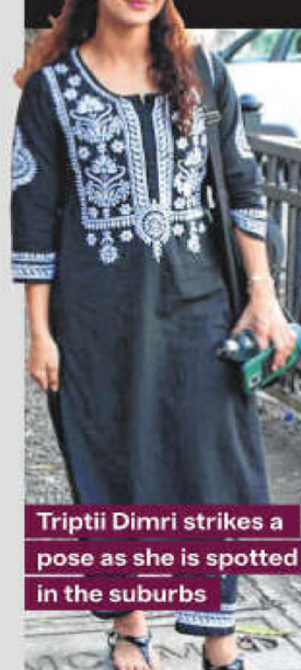
Triptii Dimri strikes a pose as she is spotted in the suburbs

Celebs were snapped as they were out and about in Mumbai