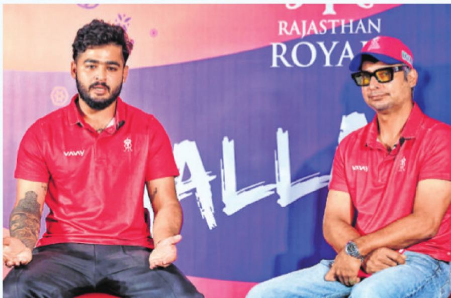
Rajasthan Royals captain Riyan Parag (L) with team's Head Coach Kumar Sangakkara during a pre-season press conference in Jaipur on Thursday.

"This year, the focus is to plan better and finish games. Small decisions in T20 cricket change the course of matches," said Parag, who also thanked the franchise for backing him in difficult times.