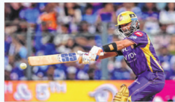
Kolkata Knight Riders' skipper Ajinkya Rahane plays a shot.

"I am really happy with the way I am batting at the moment. I am not here to show anyone how talented I am or what my game is. People are watching, so let