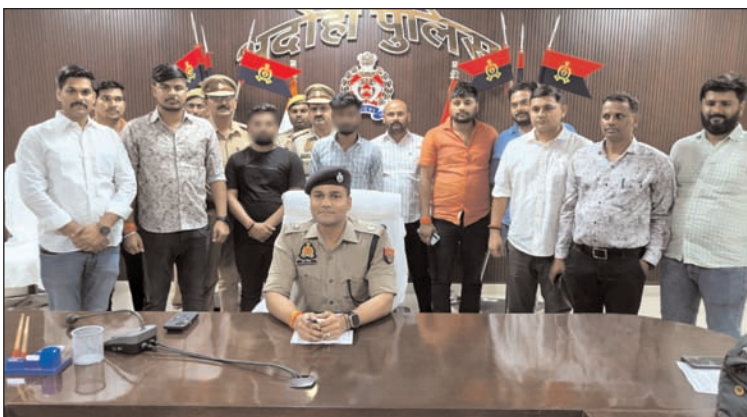
Akhand Bharat Sandesh