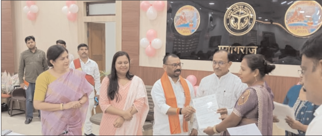
Akhand Bharat Sandesh

Prayagraj. On Monday, a state-level program organized in Lucknow—under the initiatives run by the Department of Child Development and Nutrition on behalf of the state government—was telecast live across the district. Chief Minister Yogi Adityanath distributed appointment letters to 18,440 Anganwadi workers and assistants, smartphones to 69,804 individuals, and over 200,000 growth monitoring devices. Additionally, under projects costing more than ₹450 crore, 3,170 Anganwadi center buildings and 140 Child Development Project offices were either inaugurated or had