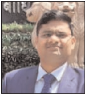
Akhand Bharat Sandesh

MLA, Other Public Representatives, and Local Residents Offer Congratulations