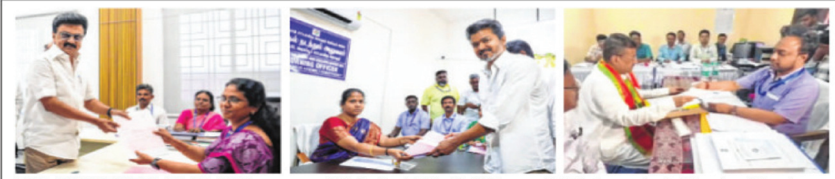
TOP GUNS ENTER FRAY: DMK supremo MK Stalin, TVK chief Vijay and BJP's Suvendu Adhikari on Monday filed their nomination papers for Kolathur and Perambur constituencies in TN and Nandigram in West Bengal. In poll affidavit, Vijay declared assets worth ₹625 crore and loans extended to all family members, including his estranged wife. Stalin reported no car and combined assets of ₹9.70 crore with his wife.