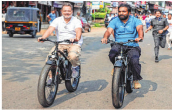
Rahul Gandhi rides a bicycle in Kottayam on Monday

Launching a sharp attack on Narendra Modi, senior Congress leader Rahul Gandhi on Monday alleged that the Prime Minister