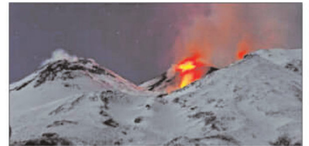
SNOW-COVERED MOUNT ETNA ERUPTS, SPEWS LAVA AND ASH: Italy's most active volcano erupted on Saturday, prompting scientists to issue a red Volcano Observatory notice for aviation, signalling a potential risk for aircraft. Despite the alert, authorities said flights continued operating normally at Catania-Fontanarossa airport, adding no disruption was expected unless ashfall increased.

Several flights, rail and ferry services in the Nordic nations have been cancelled. Roads and rail services have also been hit due to the storm conditions. In Norway's Nordland region, one of the most northerly counties in the country, the fire department responded to over 200 weather-related incidents, broadcaster NRK reported.