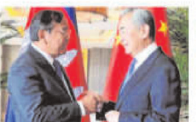
Cambodia's Prak Sokhonn China's Wang Yi.

Wang was scheduled to join both bilateral meetings with each of the diplomats and a trilateral talk on Monday. China has welcomed the ceasefire announcement, which freezes the front lines and allows for displaced civilians to return to