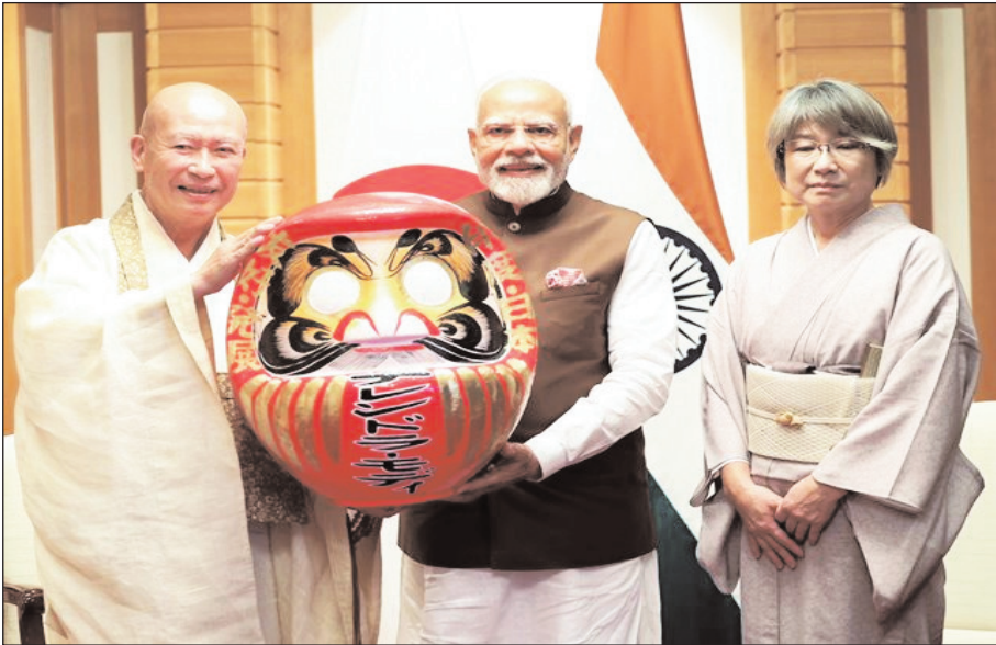
PM Modi said that India and Japan are fully committed to a free, open, peaceful, prosperous.

New Delhi. Former Reserve Bank of India (RBI) Governor Urjit Patel has been appointed as the Executive Director of the International Monetary Fund (IMF). He has been appointed for three years. Now he will represent India in the IMF. According to a government notification issued by the Ministry of Personnel on August 28, the Appointments Committee.