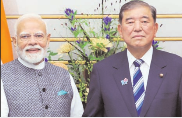
India and Japan committed to a peaceful, prosperous Indo-Pacific region: Modi

Calling to take the partnership between India and Japan to new heights, the Prime Minister on Friday said that the cooperation between the two countries will shape the Asian century. He urged Japanese companies to join the Make in India, Make for the World campaign and said that Japan's technology and India's talent together can lead global transformation. The Prime Minister addressed the India-Japan Economic Forum held in Tokyo. He said that Japan has always been an important partner in India's development journey. The partnership of the two countries in areas like metro, manufacturing, semiconductors and start-ups is a symbol of mutual trust. So far, Japanese companies have invested more than $ 40 billion in