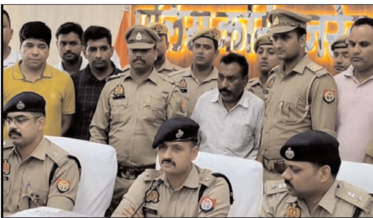
Akhand Bharat Sandesh