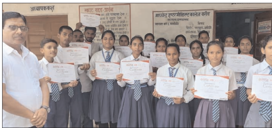
Akhand Bharat Sandesh