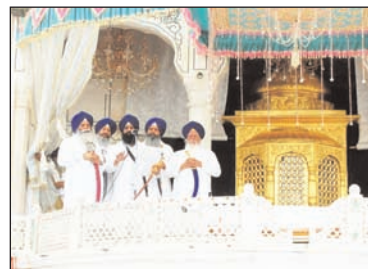
Sahib in Patna) as "tankhaiya"