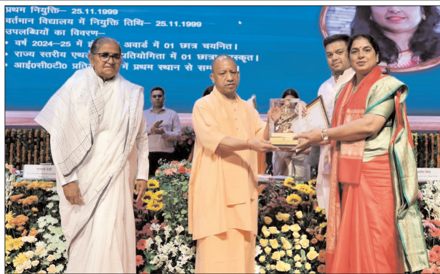
Chief Minister Yogi Adityanath on Friday honored 81 teachers selected for the State Teacher Award (66 teachers of basic education and 15 teachers of secondary education) at Lok Bhavan auditorium, Lucknow, distributed tablets to the principals of 2,204 government secondary schools.