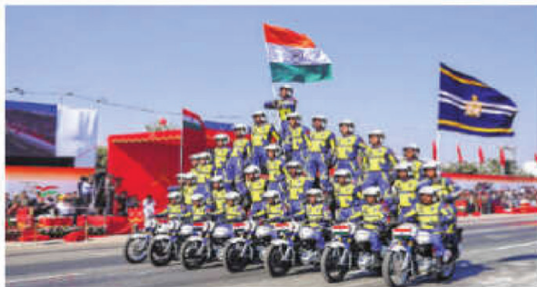
The 78th Army Day Parade in Jaipur on Thursday created history as the annual marquee event moved outside a cantonment area for the first time

When repeated knocks on the door went unanswered, hostel authorities broke open the door and found both girls hanging from ceiling fans in the room, police said.