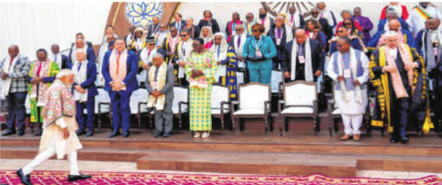
Prime Minister Narendra Modi, Lok Sabha Speaker Om Birla and others during the 28th Conference of Speakers and Presiding Officers of Commonwealth Countries (CSPOC), at the Parliament House Complex in New Delhi on Thursday

"Today, India's UPI is the largest digital payment system in the world. India is the largest vaccine producer in the world. India is the second-largest steel producer. India has the third-largest startup ecosystem. India is the third-largest aviation market. India has the fourth-largest rail net-