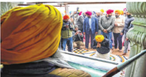
Punjab CM Bhagwant Mann offers prayers before he appeared at the Akal Takht Secretariat in Amritsar

He said that it was a conspiracy by his political rivals to create a conflict between him and the Akal Takht. Mann further held that while he submitted his clarification to the Akal Takht acting Jathedar