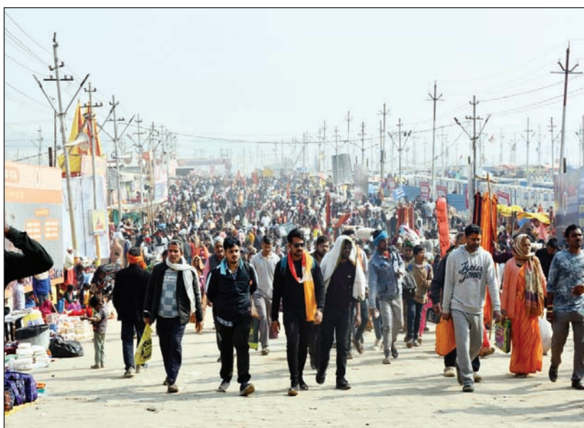
Sangam Nose. Continuous surveillance was being carried out with drone cameras.

Strict security arrangements were made in the fair area and at the