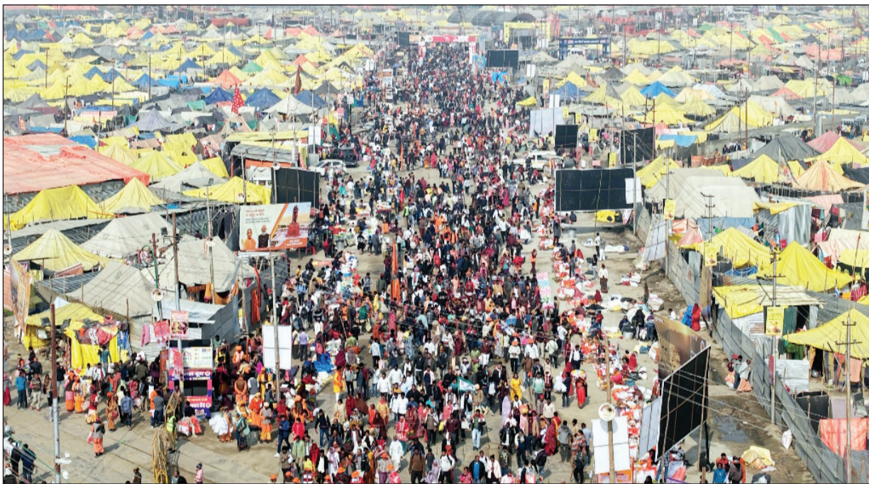
Akhand Bharat Sandesh

Prayagraj. On Makar Sankranti, the second major bathing festival of the Magh Mela, the Sangam banks were submerged in a massive surge of faith. The auspicious bathing, which began on Wednesday night due to the rare conjunction of Shatila Ekadashi and Makar Sankranti, continued uninterrupted until late Thursday night. According to the administration, by 8 PM, more than 1.03 crore devotees had taken a holy dip in the Sangam. Despite the biting cold and chill from the early morning hours, the enthusiasm of the devotees remained at its peak. Chants of "Har Har Gange" and "Jai Maa Ganga" echoed at Sangam and all the surrounding ghats. As soon as the sun came out at 9 AM, the entire fair area and all the roads leading to Sangam were filled with devotees.