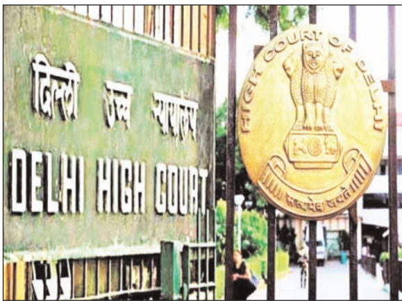
DJB served with a notice by NGT

Delhi: The Delhi high court rejected a request to have sections of the new penal code, Bharatiya Nyay Sanhita (BNS), dealing with crimes against the state and public tranquillity removed because it did not have the authority to do so. Offences against the state are addressed in Sections 147 to 158 and include, among other things, acts that threaten the sovereignty, unity, and integrity of the country, assaults on the President or Governor, and attempts to compel or restrain the exercise of any lawful power. July 1, 2017, was the effective date of the new law that superseded the Indian Penal Code (IPC). Crimes against public tranquillity are addressed under Sections 189–197 and include acts such as unlawful assembly, rioting, affray, and wanting to intentionally provoke a disturbance. Justice Anish Dayal and Chief