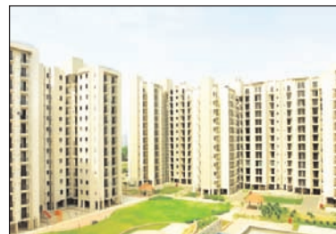
Ashoka Pahari, Rohini,

Delhi : The Housing Scheme 2025, which will provide 177 apartments for sale through online auction to those in the middle class and below, has received approval from the Delhi Development Authority (DDA). Some of the most desirable locations for these apartments include Vasant Kunj,