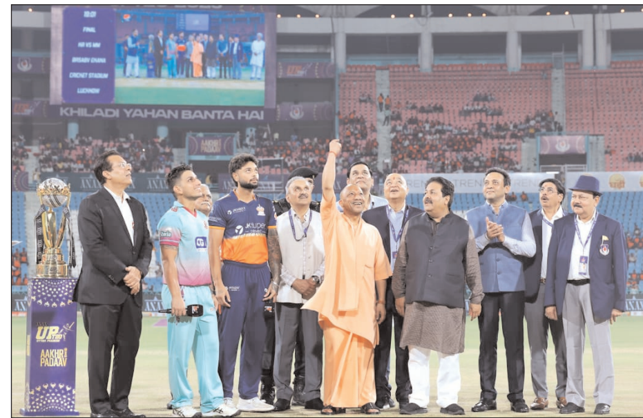
UP T20 League is better for youth, new stadiums being built across state: CM Yogi. CM Yogi rings the bell to kick off UP T20 League Final

icantly during the rainy season, and therefore sanitation drives must be conducted regularly. She strictly instructed that no negligence should be shown in insecticide spraying. She further stated that timely cleaning of drains and proper water drainage systems can effectively prevent seasonal diseases such as dengue, malaria, and diarrhea. Public AwarenessThe SDM also appealed to local residents to immediately report any problems related to waterlogging or suspected infection outbreaks to the Municipal Council control room or the concerned department, so that prompt action can be taken. She assured citizens that the administration is giving top priority to public health and civic amenities, and that any form of negligence will not be tolerated. Municipal Council staff were also present during the inspection.