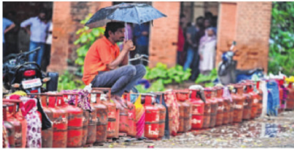
A man sits over an LPG cylinder amid rainfall, during an ongoing supply crisis, in Prayagraj on Friday