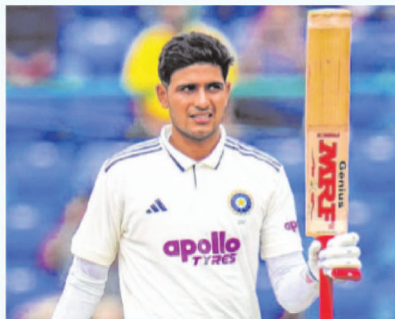
Indian Test and ODI skipper Shubman Gill.

In One-Day Internationals, Gill scored 490 runs, including 188 runs during India's