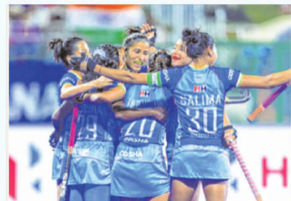
Indian hockey team topped Pool B.

However, the Dutchman made it clear that the team's objective extends beyond qualification.