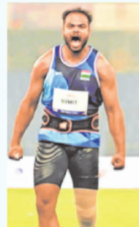
Para athlete Sumit Antil in a file pic.