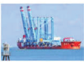
3 MONTHS, 37K KM

Both Republican and Democratic governments in the US have raised concerns about relying on cranes made in China, saying it could be risky to depend on them, hinting they may be a threat to national security. US officials say around 80% of the ship-to-