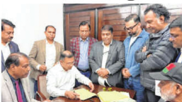
BNP leader Tarique Rahman files his nomination for the upcoming election in Segunbagicha on Monday.

The party also asked the Yunus regime to suspend the work permits of Indians