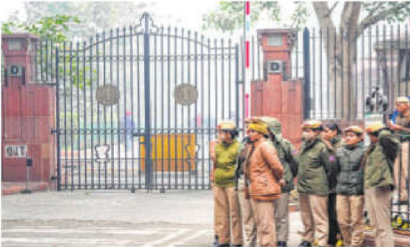
Security officials keep vigil outside the Supreme Court, in New Delhi, on Monday

"In the peculiar circumstances of the case, we stay the