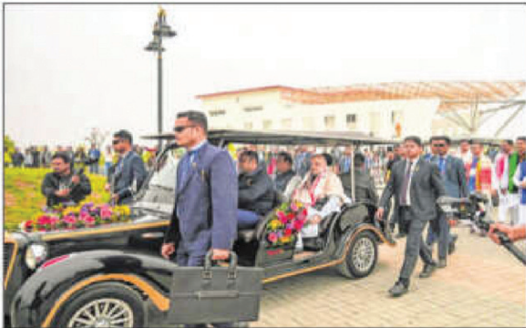
Union Home Minister Amit Shah arrives to inaugurate the newly constructed Batadrava Cultural Project, in Nagaon district, Assam, on Monday

After returning to Guwahati in a Border Security Force helicopter around mid-afternoon, Shah continued with a series of inaugurations, including the