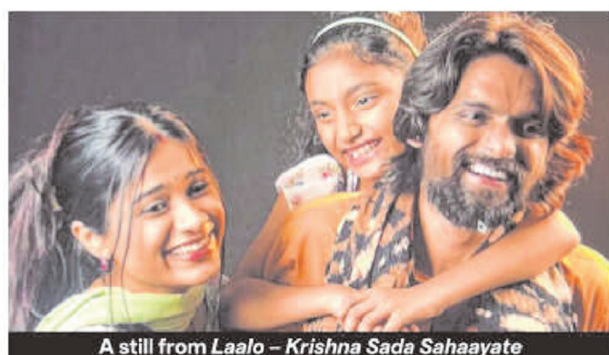
A still from Laalo - Krishna Sada Sahaayate

A fter a successful theatrical run in Gujarati, Laalo - Krishna Sada Sahaayate has released nationwide in Hindi on Friday. The film had earlier crossed Rs 100 crore at the box office in its Gujarati version.