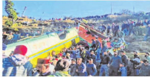
People gather around a private bus that rolled down into a deep gorge, in Sirmour district, Himachal Pradesh, on Friday