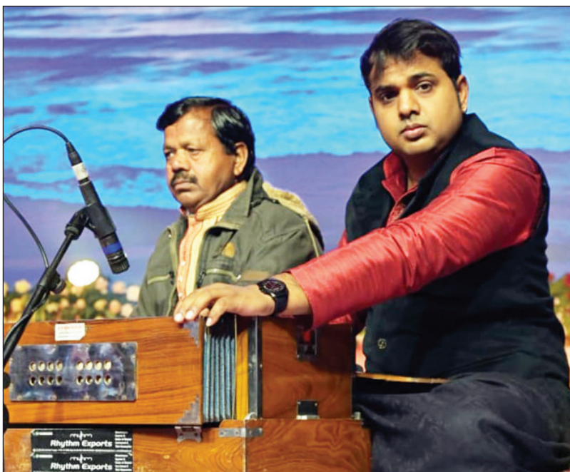
Akhand Bharat Sandesh