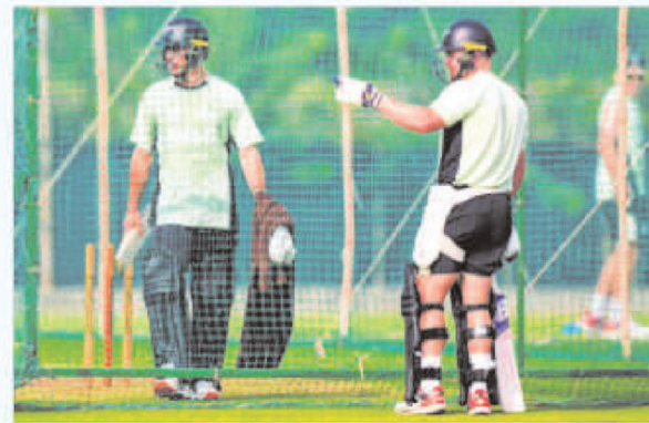
New Zealand's Will Young (L) and Glenn Phillips (R) during a practice session in Vadodara on Friday.

New Zealand squad features some young talent across the department and Young said it's up to the players to ensure they are delivering what they are required to.