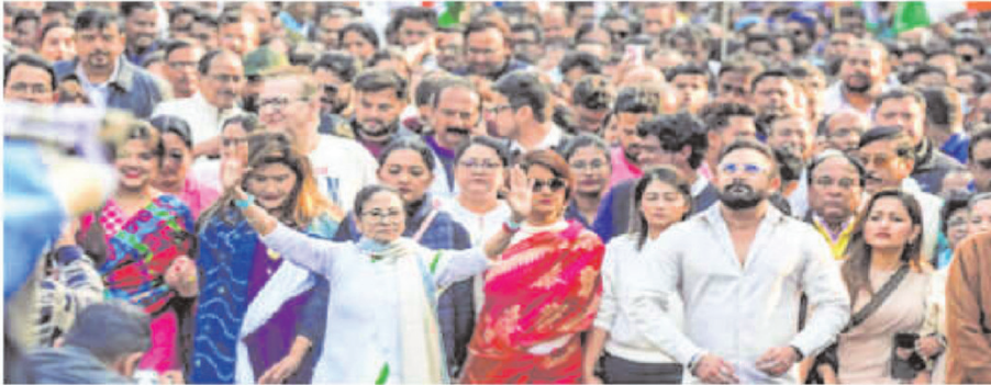
Bengal Chief Minister Mamata Banerjee leads a protest march accompanied by party leaders against the Enforcement Directorate's searches linked to political consultancy firm I-PAC, in Kolkata, on Friday

Meanwhile, several TMC MPs were detained while staging a protest outside the Home Ministry's office here on Friday against alleged misuse of probe agencies by the Centre.