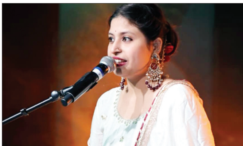
songs such as "Rama Rama Ratte," "Chal Chali Guiyan Ganga," and "Bhajan Kar Ramwa Ram Ram

presented a short Khyal in Raga Kalavati in Madhya Teen Taal. She enthralled the audience with devotional