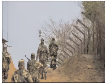
Sialkot. BSF contacted