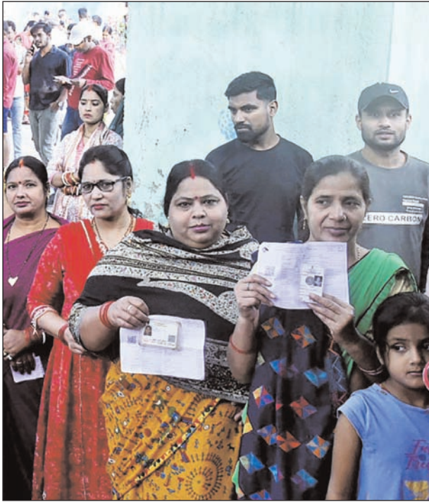
Voters show their identity cards as they queue up to cast their votes, at a polling booth during the second phase of Bihar Assembly Elections 2025, at Madhya Vidyalaya Loco, in Gaya.

every affected family in this difficult time. The Chief Minister announced an ex-gratia of 10 lakh to the next of kin of each person killed in the explosion. The Chief Minister also stated that proper treatment and financial assistance should be provided promptly to the injured so that no victim suffers due to lack of treatment. A compensation of 5 lakh will be provided to those temporarily disabled in the explosion. In addition, those seriously injured will receive 2 lakh, and those with minor injuries will receive ₹20,000. The Chief Minister stated that this accident in the Red Fort area is a profound shock not only for the affected families but for the entire Delhi. He said that all Delhiites stand united in this hour of grief.