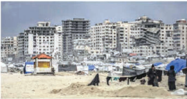
Palestinians struggle to live under harsh conditions as cold weather damages tents amid Israeli attacks