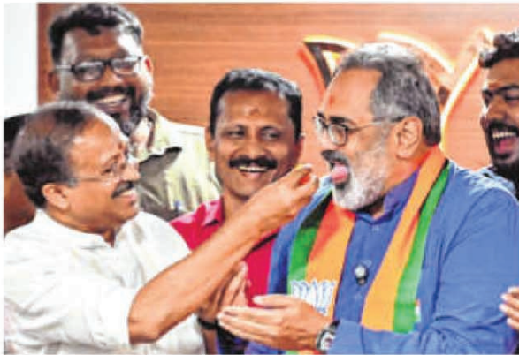
Kerala BJP President Rajeev Chandrasekhar being offered sweets by senior party leader V Muraliedharan

son Sudhanshu Trivedi while addressing a press conference at the party headquarters here said, "the results are epoch-making and a far-reaching national indication for the national politics."