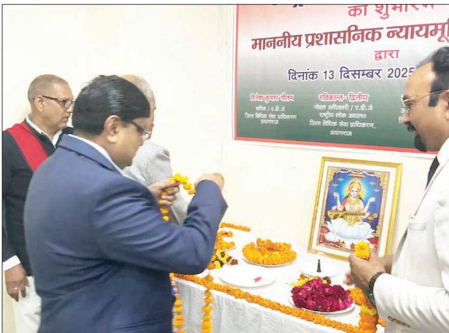
Akhand Bharat Sandesh

Record Disposal of a Total of 227,876 Cases