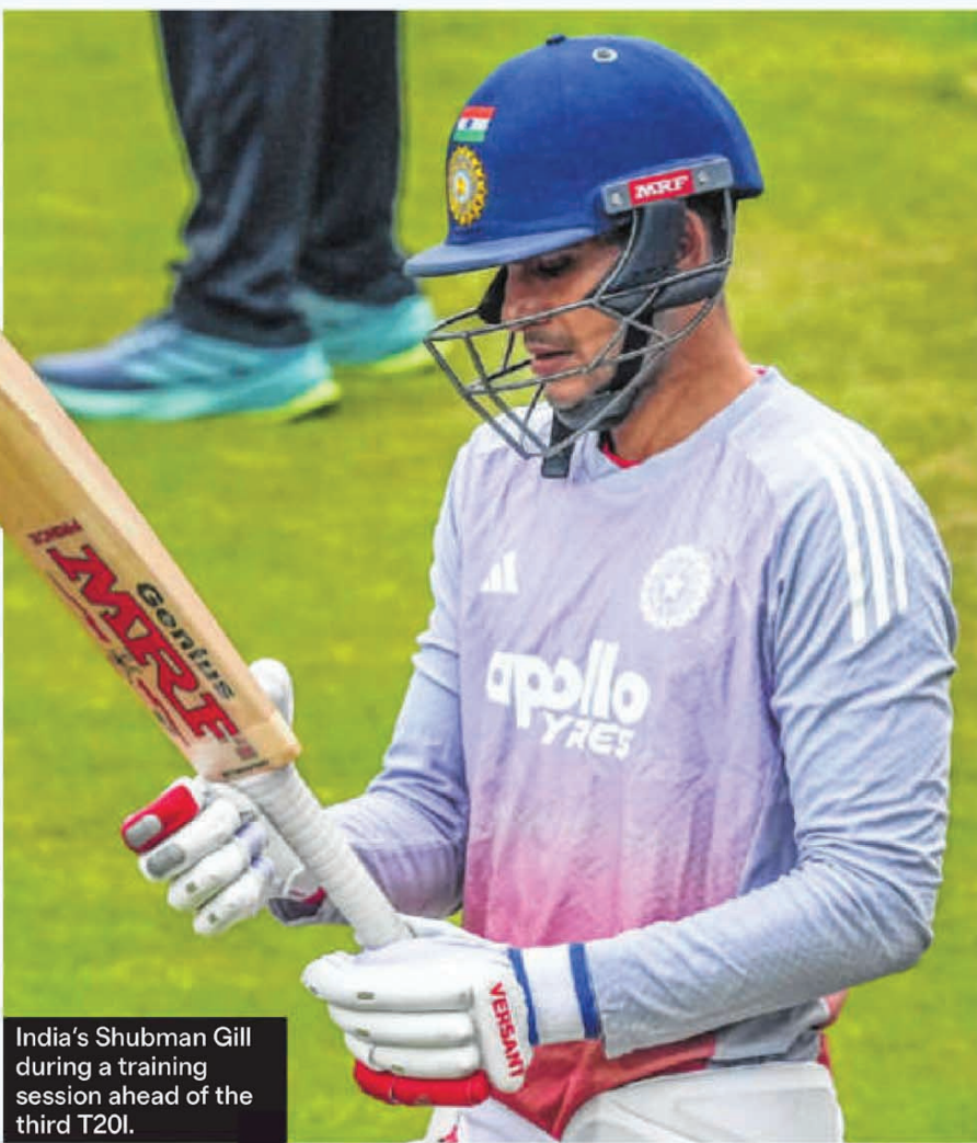
India's Shubman Gill during a training session ahead of the third T20I.

Among all T20 sides, South Africa, in terms of personnel, appears to have the requisite balance to win the trophy in the Indian subcontinent this time. Quinton de Kock's return, along with the likes of Aiden Markram, Dewald Brevis, Donovan Ferreira, David Miller and all-rounder Jansen, gives their batting an intimidating