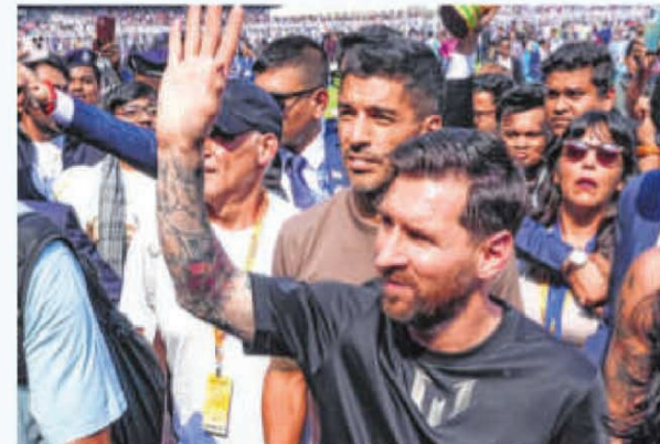
Argentina's Lionel Messi during an event as part of his 'G.O.A.T. India Tour 2025', at Vivekananda Yuba Bharati Krirangan (VYBK), in Kolkata.

crew neck half sleeve T-shirt, a black pant and a pair of sport shoes, the World Cup-winning Argentine captain entered the stadium to a deafening cheer of the crowd.