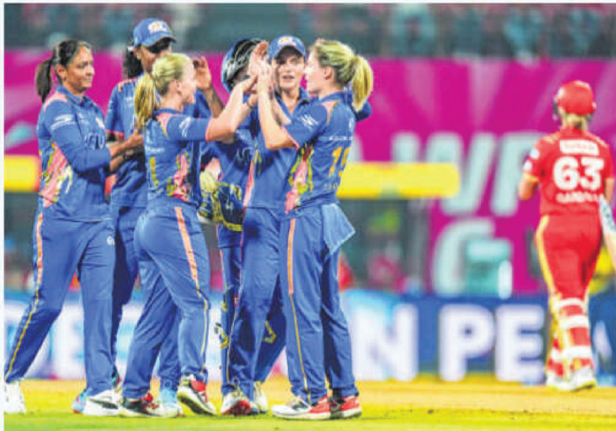
Mumbai Indians' Nicola Carey (R) celebrates with teammates after taking the wicket of Gujarat Giants' Ashleigh Gardner in Navi Mumbai on Tuesday.

Earlier, electing to field first after winning the toss, Mumbai Indians copped an early blow when G Kamalini dropped a regulation caught behind opportunity to let off