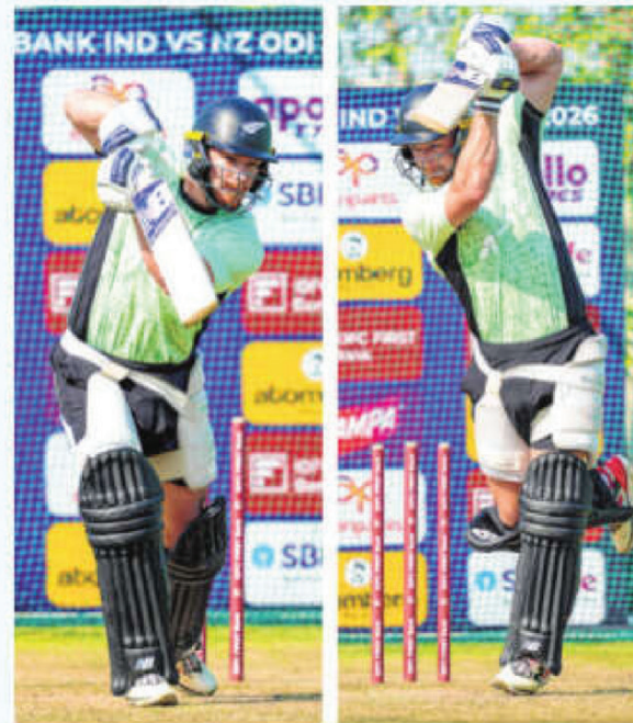
A combo of two pictures shows New Zealand's Glenn Phillips batting left-handed and right-handed during a training session in Rajkot on Tuesday.

Despite the available options, India's white-ball set up would not want to see more injuries with the T20 World Cup less than a month away. That squad would feature an entirely different batting line-up from the one in the ODIs. But some names are common to both sides and an important one, all-rounder Tilak Varma, is out of at least the first three T20Is against the Kiwis due to a groin injury.