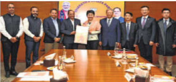
Communist Party of China's Sun Haiyan visits BJP HQ. Chinese Ambassador to India Xu Feihong was also present. They met BJP delegation headed by party general secretary Arun Singh

While the BJP usually plays up social and even diplomatic events, and a large number of its leaders then endorse them on their