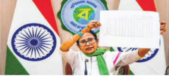
West Bengal CM Mamata Banerjee addresses a press conference over the issue of Special Intensive Revision of electoral rolls, in Kolkata, on Tuesday