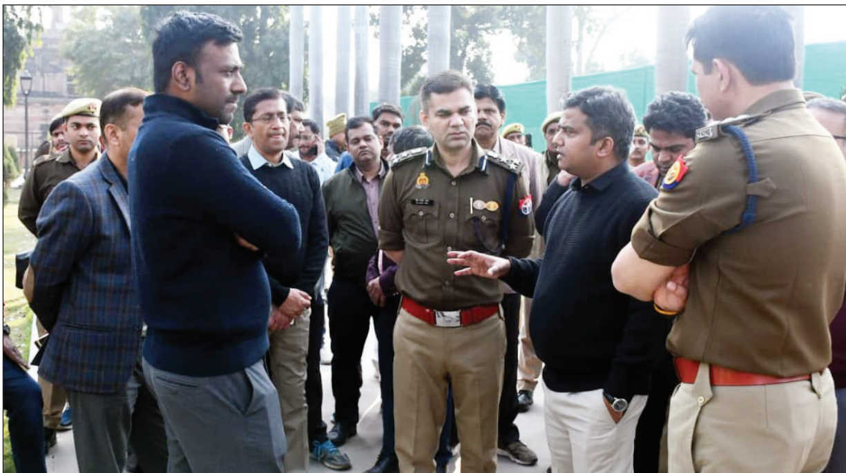
Akhand Bharat Sandesh

He instructed officials to ensure all necessary arrangements are in place