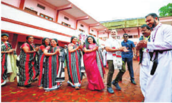
Congress leader Rahul Gandhi attends golden jubilee celebrations of St Thomas English High School, in Nilgiris district, Tamil Nadu, on Tuesday

KVN Productions LLP has filed an appeal against the order passed by a division bench of the high court last Friday, which put on hold the