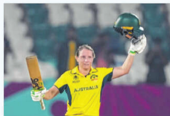
Australia women's cricket team skipper Alyssa Healy will play his last series against India.