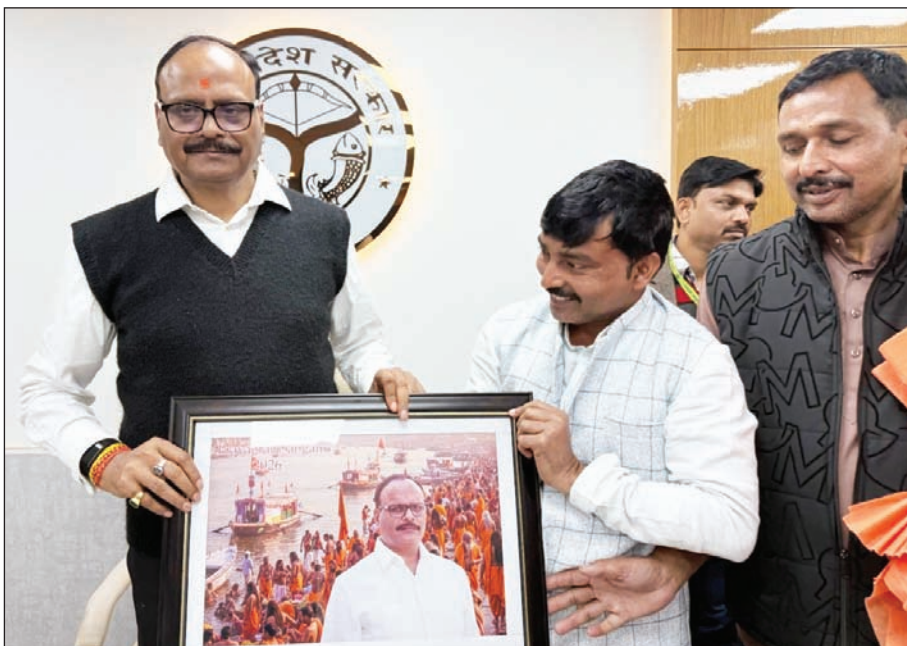
Akhand Bharat Sandesh