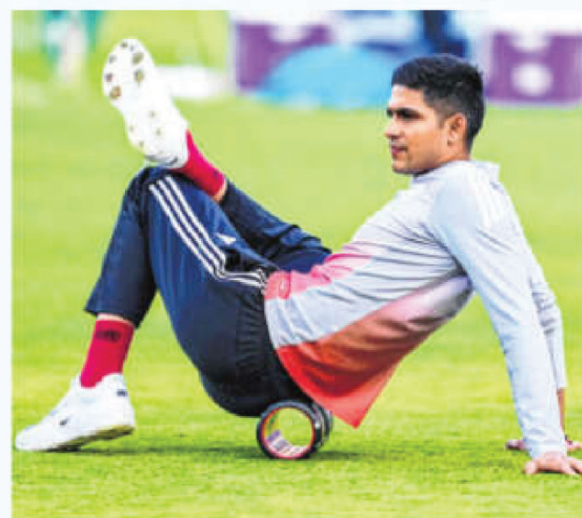
India's captain Shubman Gill during a training session ahead of the second ODI in Rajkot on Tuesday.