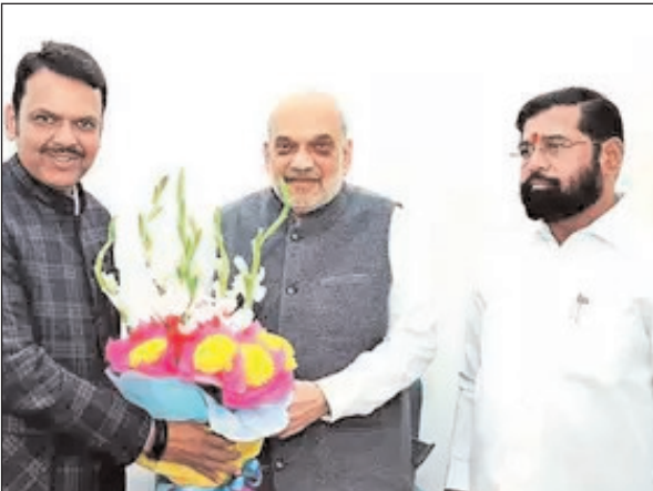
"It's the CM's prerogative to decide portfolios"

NEW DELHI: BJP on Saturday announced that the new Mahayuti govt will be sworn in on Dec 5 in what is being seen as a signal to Eknath Shinde to make up his mind fast about joining the govt led by Devendra Fadnavis. State BJP chief Chandrashekhar Bawankule said in a post on X that the swearing-in ceremony will take place at Azad Maidan and PM Modi would attend it. "The wait for this historic swearing-in is over. We thank the public for their support," Bawankule said. CM will be from BJP, deputies from NCP & Sena, says Ajit The announcement came after talks had paused after the three Mahayuti netas, caretaker CM Eknath Shinde, Fadnavis and Ajit Pawar met home minister Amit Shah in Delhi. The unambiguous post on X and the timing of it came as a surprise because there