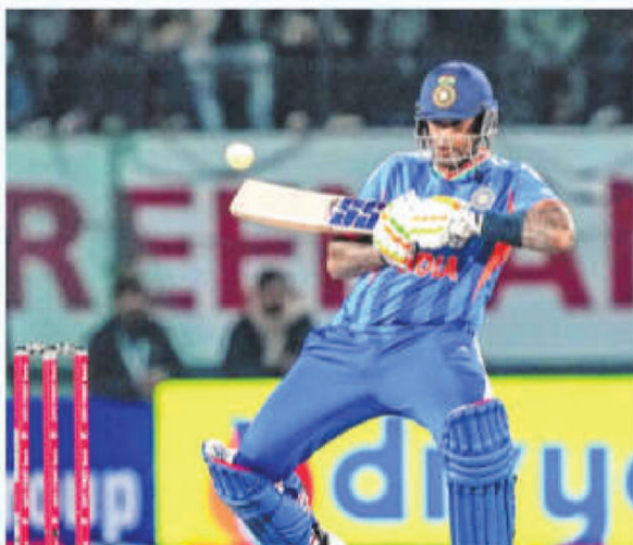
India's captain Suryakumar Yadav plays a shot during the third T20I against South Africa on Sunday.

Additionally, he's still without a half-century in 2025, the longest such phase of his career.