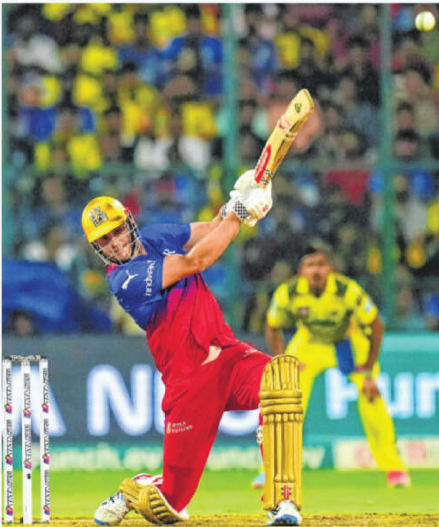
Former Royal Challengers Bengaluru's all-rounder Cameron Green was bought by Kolkata Knight Riders for a record-breaking Rs 25.20 crore on Tuesday.

Entering the auction at a base price of ₹2 crore, Pathirana became the most expensive Sri Lankan sold in an IPL auction.