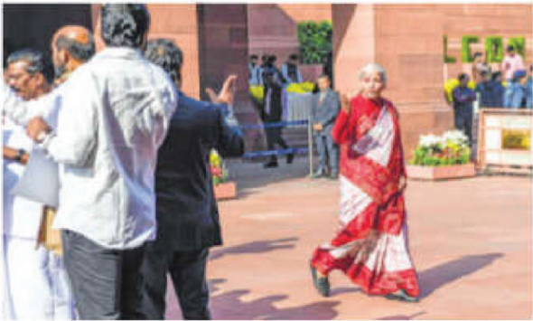
Union Minister Nirmala Sitharaman arrives at Parliament premises during the ongoing Winter Session, in New Delhi on Tuesday