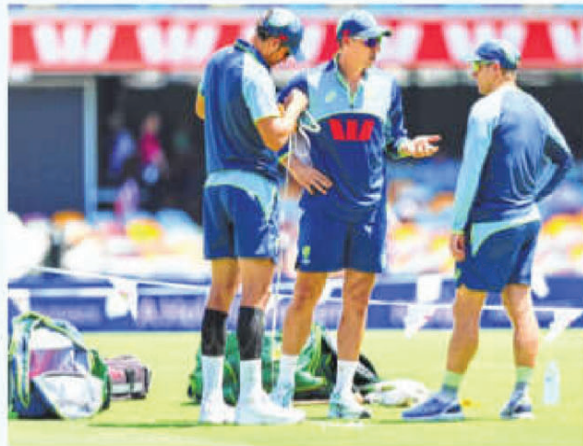
Australia's Pat Cummins (C) ahead of the second Ashes Test with England in Brisbane on December 4.