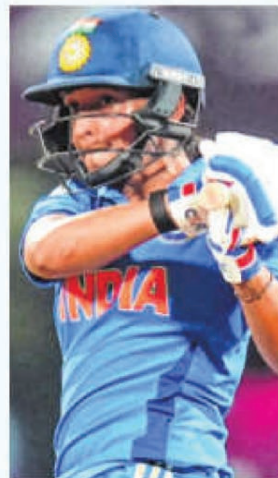
Harmanpreet Kaur scored 89 vs Australia in the semifinal.

Having experienced the lows and setbacks of losing two World Cup finals in the