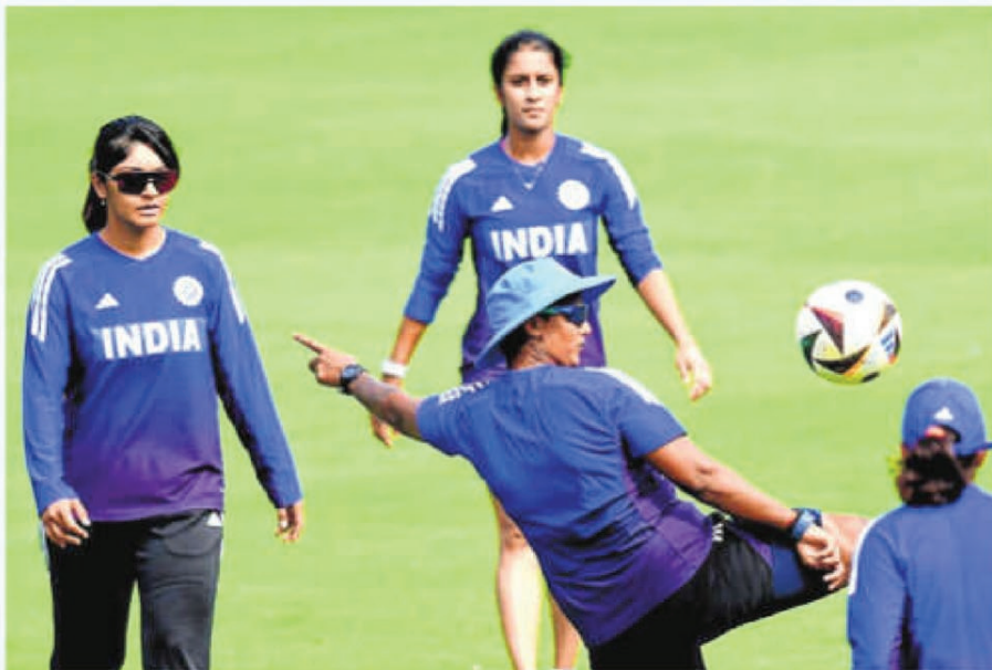
Indian women's players during a practice session ahead of the ODI WC final.

The likes of Shafali Verma, who was not even part of the original squad, would look to make their presence felt on the huge occasion with a World Cup title on