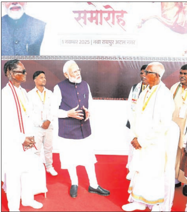
The Prime Minister visited and visited the Tribal Freedom Fighters Museum in Nava Raipur, Chhattisgarh.

NEW DELHI: Addressing a poll rally, BJP president and Union minister Jagat Prakash Nadda launched a sharp attack on Tejashwi Yadav's party, saying, "RJD nominated late gangster Shahabuddin's son, which shows it wants to bring back jungle raj in Bihar." "They Talk, We Act": JDU's Bijendra Prasad Yadav Slams Tejashwi, Rubbishes Mahagathbandhan Manifesto Recalling the turbulent years of the 1990-2005 RJD regime, Nadda said, "From 1990 to 2005, the rule of Lalu Prasad Yadav and Rabri Devi was a dark era for Bihar — it suffered every kind of loss during that time. It endured every kind of humiliation... But under the leadership of Nitish Kumar for 20 years and 11 years of PM Modi, it has seen its development train back on track." He urged voters to back the in the upcoming polls: "When you cast your vote on the 6th of November, I want to request that this vote is not just for candidates... It's a vote to provide stability to Bihar.