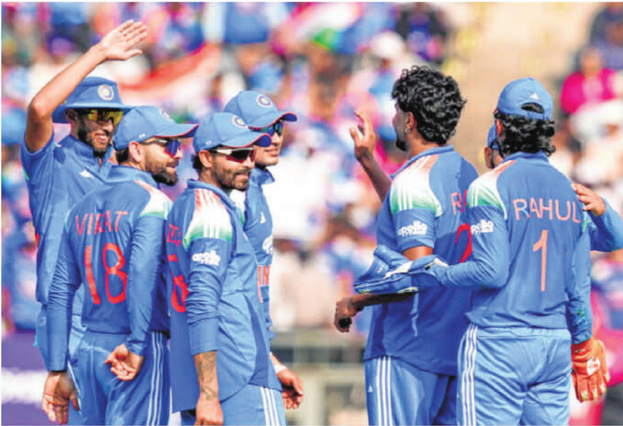
India's Harshit Rana celebrates with teammates after taking the wicket of New Zealand's Henry Nicholls during the first ODI at Kotambi Stadium in Vadodara on Sunday.