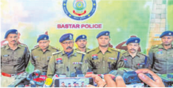
IGP (Bastar Range) Sundarraj Pattilingam, front left, addresses a press conference, after security forces killed 14 Naxalites, in Chhattisgarh's Sukma and Bijapur districts, on Saturday

In the first Naxalite encounter of 2026, at least 14 Maoists, including wanted ultras Vetti Mangdu and Madvi Hunga, were killed in separate encounters in Chhattisgarh's Sukma and Bijapur districts in the Bastar region on Saturday, officials said. While 12 Naxalites, including Mangdu and Madkam, and five women, were neutralised by the security forces during an exchange of fire in Sukma, the bodies of two Maoist cadres were found in the forests of Gaganpalli village in Basaguda, Bijapur. State Police unit, District Reserve Guard (DRG) had launched the anti-naxal operations based on inputs about the presence of Maoist cadres, a senior police official said.