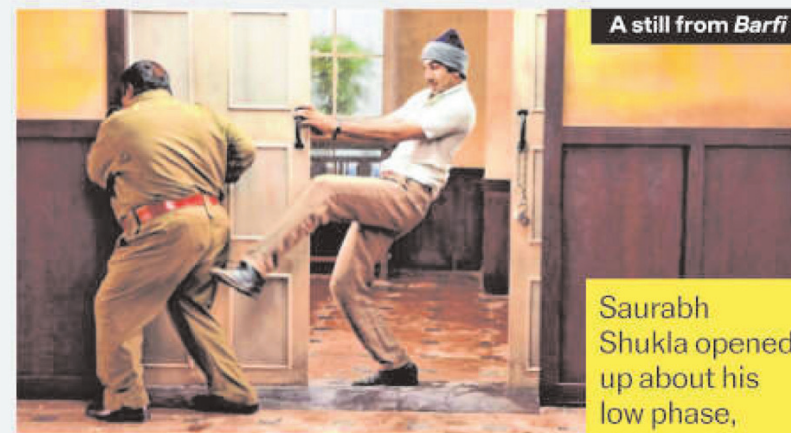
A still from Barfi