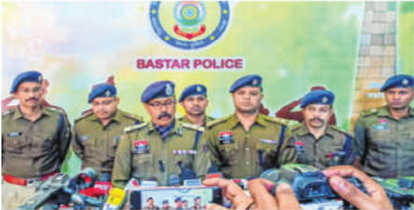
IGP (Bastar Range) Sundarraj Pattilingam, front left, addresses a press conference, after security forces killed 14 Naxalites, in Chhattisgarh's Sukma and Bijapur districts, on Saturday

In the first Naxalite encounter of 2026, at least 14 Maoists, including wanted ultras Vetti Mangdu and Madvi Hunga, were killed in separate encounters in Chhattisgarh's Sukma and Bijapur districts in the Bastar region on Saturday, officials said. While 12 Naxalites, including Mangdu and Madkam, and five women, were neutralised by the security forces during an exchange of fire in Sukma, the bodies of two Maoist cadres were found in the forests of Gaganpalli village in Basaguda, Bijapur. State Police unit, District Reserve Guard (DRG) had launched the anti-naxal operations based on inputs about the presence of Maoist cadres, a senior police official said.