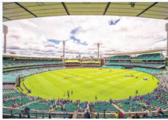
Police with long-armed rifles, a rarity at sporting events in Australia, will patrol the final Ashes cricket test in Sydney starting Sunday as part of heightened security measures following the Bondi Beach terror attack in the city.

Naveed Akram, 24, one of the two accused gunmen, is facing 59 charges over the attack that includes 15 counts of murder. Akram was shot by police at the scene and spent days in a coma.