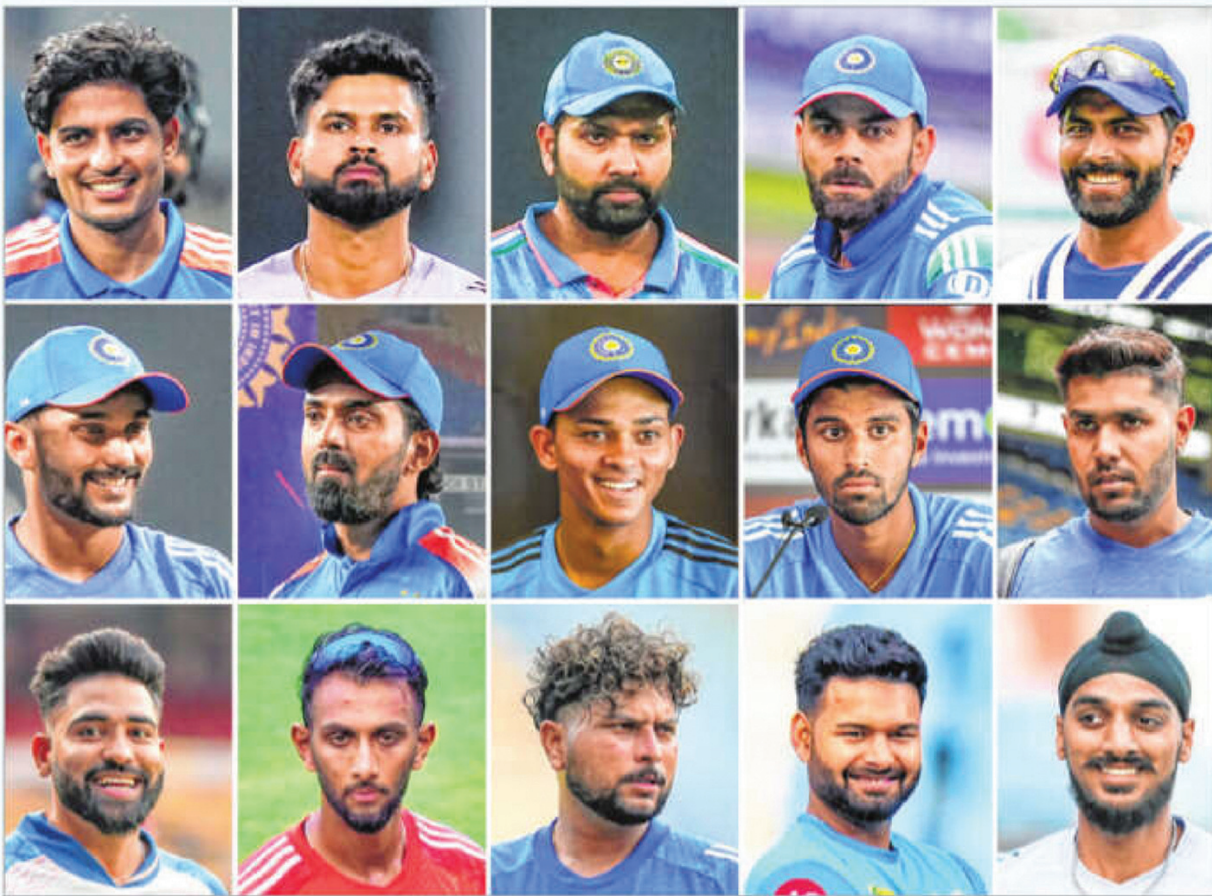
Members of India's ODI squad for series against New Zealand; top row left to right, captain Shubman Gill, vice captain Shreyas Iyer, Rohit Sharma, Virat Kohli, Ravindra Jadeja; middle row left to right, Nitish Kumar Reddy, KL Rahul, Yashasvi Jaiswal, Washington Sundar, Harshit Rana; bottom row left to right, Mohammed Siraj, Prasidh Krishna, Kuldeep Yadav, Rishabh Pant, and Arshdeep Singh.

Ruturaj Gaikwad could not get the selectors' nod