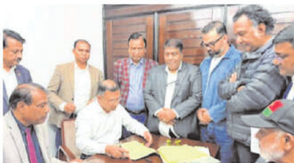
BNP leader Tarique Rahman files his nomination for the upcoming election in in Segunbagicha on Monday.

The party also asked the Yunus regime to suspend the work permits of Indians