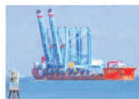
3 MONTHS, 37K KM

Both Republican and Democratic governments in the US have raised concerns about relying on cranes made in China, saying it could be risky to depend on them, hinting they may be a threat to national security. US officials say around 80% of the ship-to-