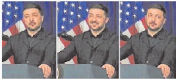
'Russia wants to see Ukraine succeed': Zelenskyy reacts to Trump's claim

He said the peace plan should be signed by Ukraine, the US, Russia and Europe,