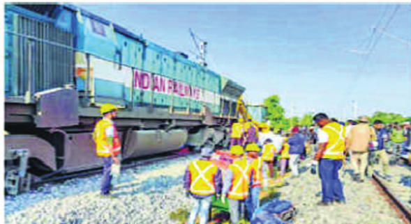
Restoration work is underway after seven elephants were killed when Sairang-New Delhi Rajdhani Express hit a herd in the Jamunamukh-Kampur section under Lumding Division of N.F. Railway, in Hojai on Saturday

The Supreme Court, on November 20, 2025, accepted the recommendations of a committee under the Ministry of Environment, Forests and Climate Change