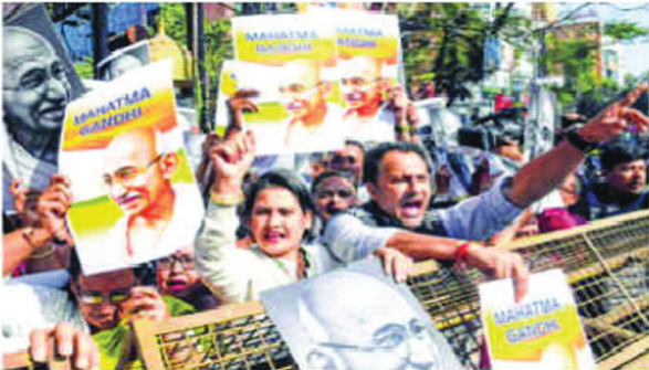
Congress workers holding posters of Mahatma Gandhi stage a protest to oppose the central government's decision to repeal MGNREGA Act at Rajiv Bhawan, in Guwahati on Sunday

Besides providing for 125 days of wage employment, the Act also facilitates adequate availability of agricultural labour during peak sowing and harvesting seasons by empowering states to notify a pause period aggregating to sixty days in a financial year, the Ministry said.