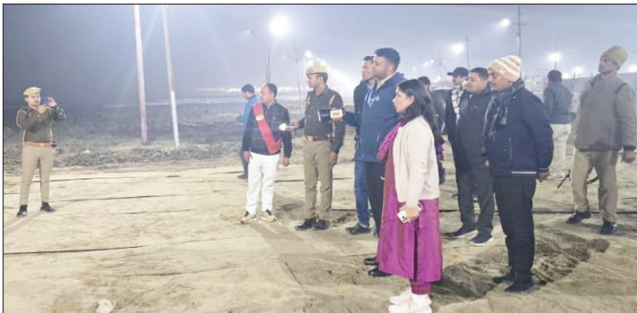
Akhand Bharat Sandesh

In the meeting, the Divisional Commissioner instructed the Mela Officer to deploy additional manpower to complete all the remaining works within the stipulated time