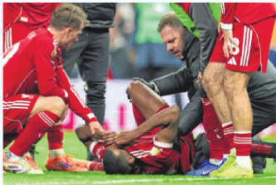
Liverpool's Alexander Isak reacts after sustaining an injury against Tottenham in London on Saturday.

Isak just can't catch a break at Liverpool. The Sweden striker has struggled in his first few months as British soccer's record signing, having joined Liverpool after training mostly alone in the offseason. He then recently had time out with a groin injury. On as a sub against Tottenham, Isak scored within 11 minutes but in the act of converting his finish his left ankle was hurt by a challenge from Tottenham's Micky van de Ven.