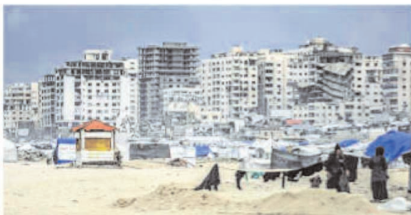
Palestinians struggle to live under harsh conditions as cold weather damages tents amid Israeli attacks