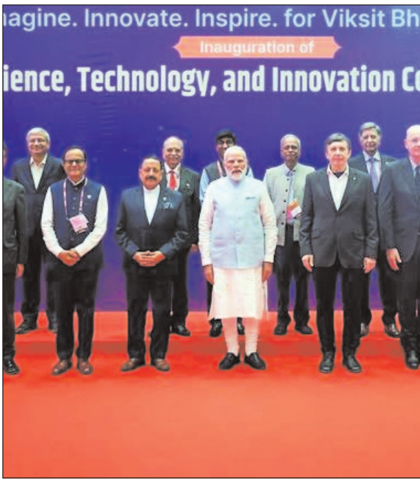
Prime Minister Narendra Modi in a group photo during the inauguration of the Emerging Science, Technology, and Innovation Summit 2025, at Bharat Mandapam, in New Delhi on November 3, 2025.

NEW DELHI: Prime Minister Narendra Modi on Monday accused the Congress and Rashtriya Janata Dal (RJD) of terming the Chhath festival as “drama” while they celebrate “foreign festivals.” While addressing a rally in poll-bound Bihar’s Saharsa, the Prime Minister slammed RJD supreme Lalu Prasad Yadav for celebrating Halloween with his grandchildren and claimed that INDIA bloc leaders will never find time to visit the Ram Temple in Ayodhya. PM Modi Rips Into RJD-Congress For ‘Insulting Faith’, Warns Bihar Voters “These RJD and Congress people travel all over the world. We read about it on social media and feel ashamed, but they don’t find time to visit the Ram Temple. There’s a temple built there for Nishad Raj,” PM Modi said. “There’s also a temple for Lord Valmiki in Ayodhya. There’s also a temple for Shabari Mata in Ayodhya. If you have a problem with Ram, at least bow your head at the feet of Nishad Raj.