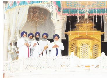
Sahib in Patna) as "tankhaiya"