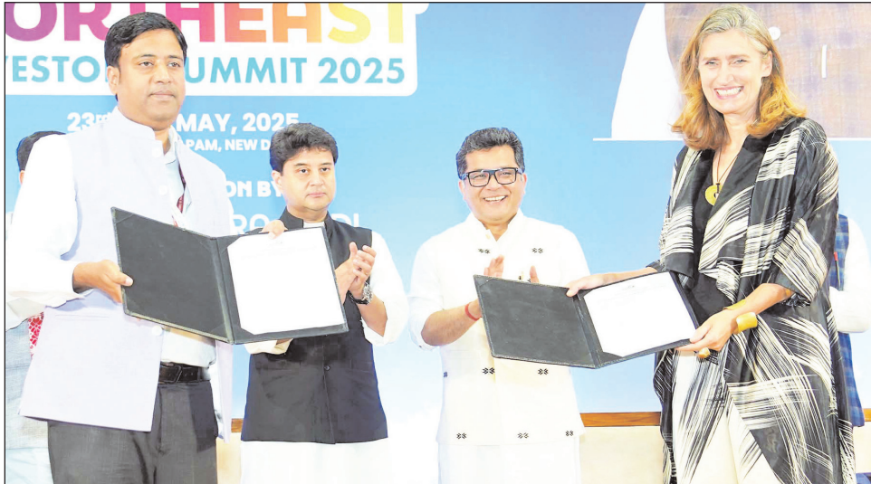
Union Minister for Communications and Development of North Eastern Region (DoNER) Jyotiraditya M. Scindia, Minister of State for External Affairs and Textiles Pabitra Margherita and Minister of State for Education and Development of North Eastern Region (DoNER) Dr. Sukanta Majumdar will participate in the closing session.

Bharat@2047: States and Centre unite at key NITI Aayog meet led by PM Modi Mamata, Vijayan among CMs to skip meeting Bengal chief minister Mamata Banerjee and three chief ministers from Southern states, including from NDA ruled Puducherry, skipped the Niti Aayog's Governing Council meeting, news agency PTI reported. While the CM of Congress-ruled Karnataka, Siddaramaiah, was busy with "prior engagement" in the state and sent his speech to be read out in the council, Marxist veteran and Kerala CM, Pinarayi Vijayan deputed his cabinet colleague K N Balagopal on his behalf. Similarly, Puducherry chief minister N Rangasamy, who heads the AINRC-led NDA coalition in the union territory, also skipped the event, an official source was quoted as saying by the PTI.