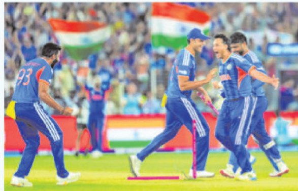
India's Jasprit Bumrah, Abhishek Sharma, Sanju Samson and Shivam Dube celebrate after winning the T20 World Cup.

Scotland received USD 278,654 for their participation and performance, while Ireland took home USD 271,731.