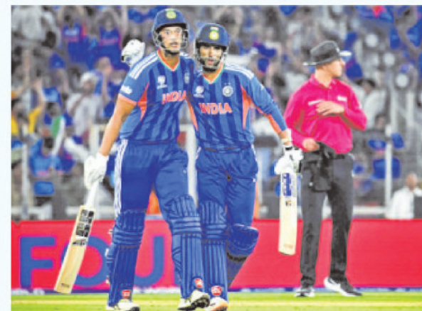
India's Shivam Dube and Tilak Varma hug each other after finishing the first innings.

According to the official, railway staff became curious after noticing Dube's name on the reservation chart. A ticket checker wondered if the passenger was the cricketer Shivam Dube. However, his