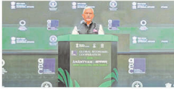
External Affairs Minister S. Jaishankar speaking at the Global Economic Cooperation Conference.

"The established global order is clearly changing. Replacements are hard to create, and we appear to be headed to a long twilight zone. This will be messy, risky,