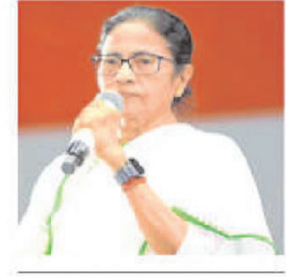
She said documents accepted in other states like Bihar were being rejected in Bengal, asking why the state was targeted.

"In the name of deletion of voters' names the poll body is snatching away the rights of the voters. A woman functionary in the BJP IT cell removed