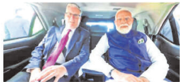
File pic of PM Narendra Modi with UK's Keir Starmer

The committee said the agreement would help UK