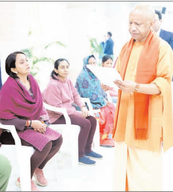
UP Chief Minister Yogi listened to the problems of the people in the Janta Darshan organized at his official residence 5- Kalidas Marg, Lucknow and directed the concerned officials to resolve the public problems on priority basis.

Radhakrishnan appealed for smooth proceedings. However, senior Congress MP and Leader of the Opposition in the Rajya Sabha Mallikarjun Kharge criticized the government.