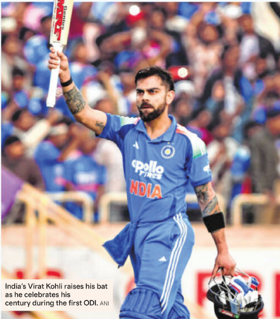
India's Virat Kohli raises his bat as he celebrates his century during the first ODI.

Following his 83rd international hundred, Kohli had spoken about his mindset and preparation at this stage of his career.