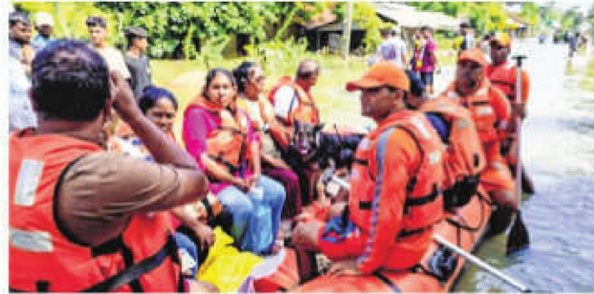
NDRF team rescues stranded people in Sri Lanka, under Operation Sagar Bandhu in the wake of Cyclone Ditwah, in Puttalam on Monday

PM Narendra Modi on Monday spoke to Sri Lankan President Anura Kumara Disanayake and assured him of continued support in the rehabilitation efforts across all regions impacted by Cyclone Ditwah. Meanwhile, the last batch of 104 Indians stranded in Sri Lanka has been evacuated and brought back home onboard IAF aircraft on Monday.