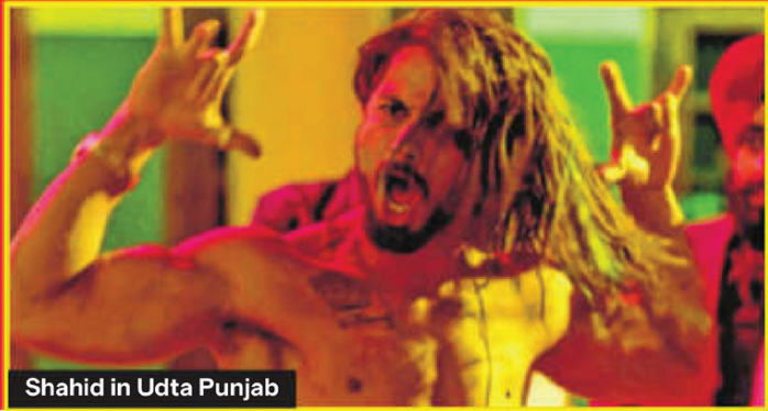
Shahid in Udta Punjab