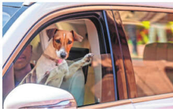
A dog seen inside Congress MP Renuka Chaudhary's car outside the Parliament in New Delhi, on Monday

"Those sitting inside bite, dogs don't," Congress MP Renuka Chowdhury said on Monday after she arrived in Parliament with a rescued stray in her car, triggering a row and prompting some ruling party members to accuse her of indulging in drama.