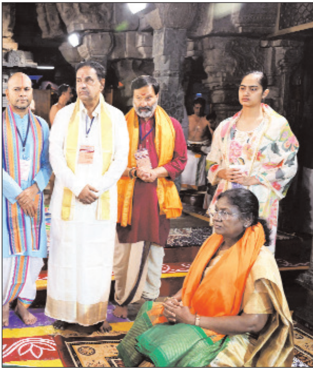
President of India Draupadi Murmu visited and offered prayers at Sri Venkateswara Swamy Temple in Tirumala, Andhra Pradesh.