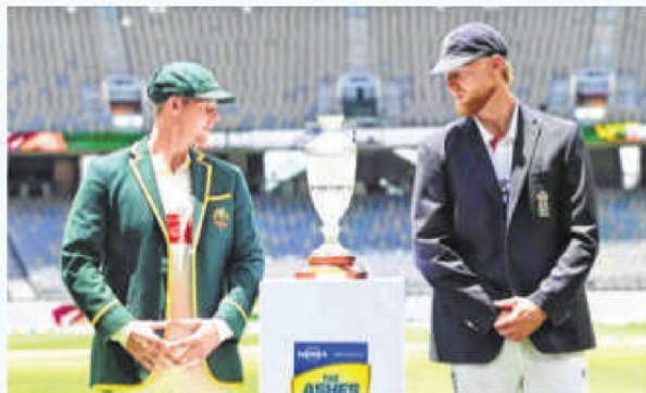
Australian captain Steve Smith (L) and England captain Ben Stokes pose with the Waterford Crystal Ashes Trophy in Perth on Thursday.

Australia captain Pat Cummins and fellow pace-man Josh Hazlewood will be missing the first test because