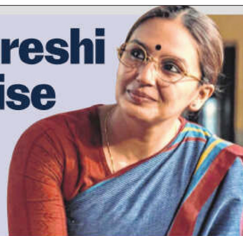
A still from Maharani 4

Actress says she shuts out external pressure, focusing on her own artistic vision and personal growth while promoting Maharani 4