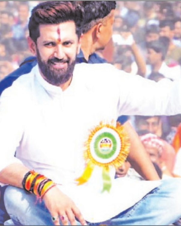
Chirag Paswan played the role of 'Hanuman' in Bihar elections

schemes, and a focus on girls' education swayed a large number of women voters to the NDA. At the same time, by reminding the youth about jobs, skill development, and the "jungle raj," the NDA also strongly wooed young voters. One of the key election issues in Bihar, the Nitish Kumar-led NDA government's decision to deposit ?10,000 each into women's accounts under the "Chief Minister Women's Employment Scheme," became a decisive factor, especially among women voters. The primary objective of this scheme was to empower women in the state by making them self-reliant and economically empowering them by providing self-employment opportunities.