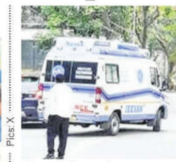
The ambulance from Mumbai's Breach Candy Hospital in which Dharmendra was taken home on Wednesday morning.