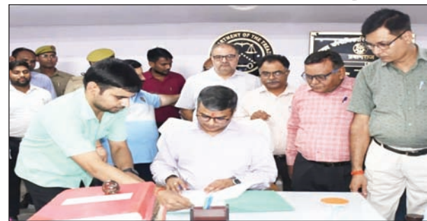
Akhand Bharat Sandesh