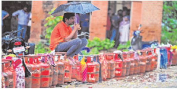
A man sits over an LPG cylinder amid rainfall, during an ongoing supply crisis, in Prayagraj on Friday