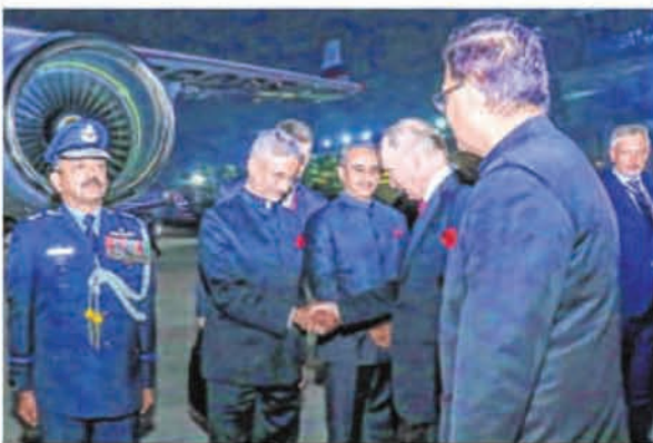
Union External Affairs Minister S Jaishankar greets Russian President Vladimir Putin as the latter prepares to depart from New Delhi

"I think for any country to expect to have a veto or a say in how we develop our relations with others is not a reasonable proposition," S Jaishankar was asked if Putin's two-day visit to New Delhi that focused largely on significantly enhancing the