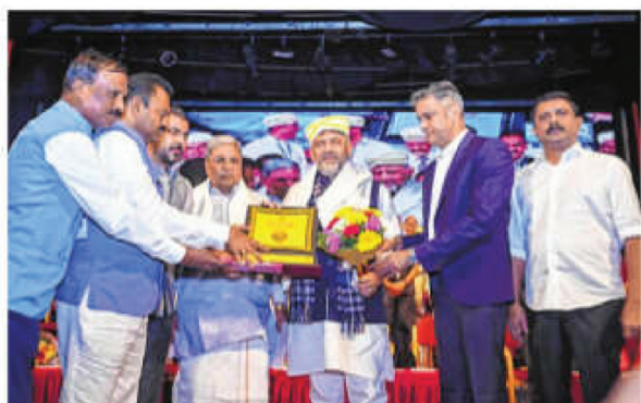
Karnataka Minister DK Shivakumar at the award presentation ceremony of the Karnataka Half-Language Culture and Literature Academy 2024, in Bengaluru

"I have to take everyone along. All 140 MLAs are dear to me. I never differentiate with anyone. I have no differences of opinion with anyone," the Deputy CM said.