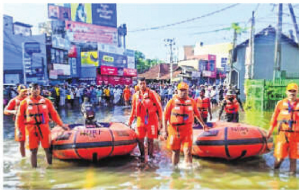
India's NDRF personnel undertake relief operations as part of Operation Sagar Bandhu in Sri Lanka

India sent two urban search and rescue teams comprising 80 NDRF personnel to the