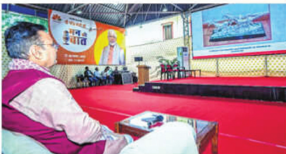
Rajasthan Chief Minister Bhajanlal Sharma listens to Prime Minister Narendra Modi's 'Mann ki Baat' at Sangar camp office, in Jaipur on Sunday

"Just last week, Skyroot's Infinity Campus gave a new boost to India's space ecosystem. This is a reflection of India's new thinking, innova-