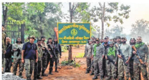
Indo-Tibetan Border Police (ITBP) pose for a group picture after completing a year-long strategic advance into the Abujmahad region, successfully sealing the last major interstate corridor used by Naxal insurgents, in Narayanpur on Sunday.

The initiative, launched by Bastar range police, has been emerging as a transformative drive for establishing lasting peace, dignity and compre-