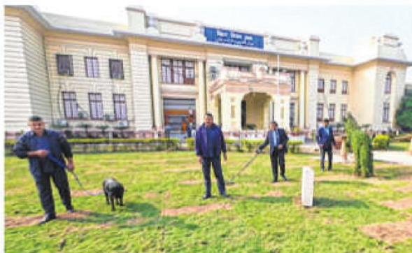
Bomb squad inspects the Bihar Assembly complex ahead of Winter session, in Patna on Sunday

"Majority of the Congress candidates have held the view that the party would have done better had there not