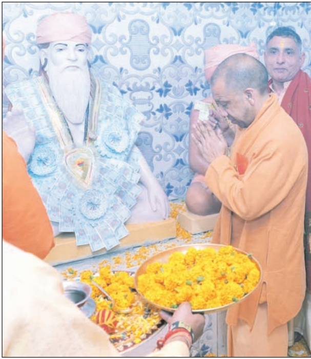
Uttar Pradesh Chief Minister Yogi Adityanath at the grand Aathman Bhandara and idol consecration ceremony held in Jhajjar, Haryana on Sunday.

everyone, to the country. There is a method for discussing every issue in Parliament. There are rules and traditions." Kiren Rijiju said, "In the winter session, we hope everyone will work with a calm mind and avoid heated debates.