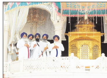
Sahib in Patna) as "tankhaiya"