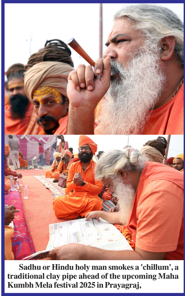
Sadhu or Hindu holy man smokes a 'chillum', a traditional clay pipe ahead of the upcoming Maha Kumbh Mela festival 2025 in Prayagraj,