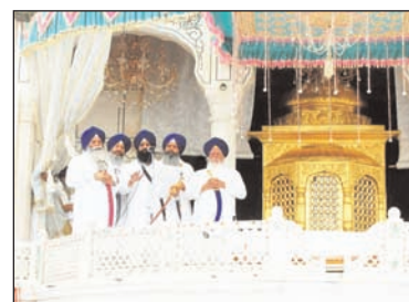
Sahib in Patna) as "tankhaiya"