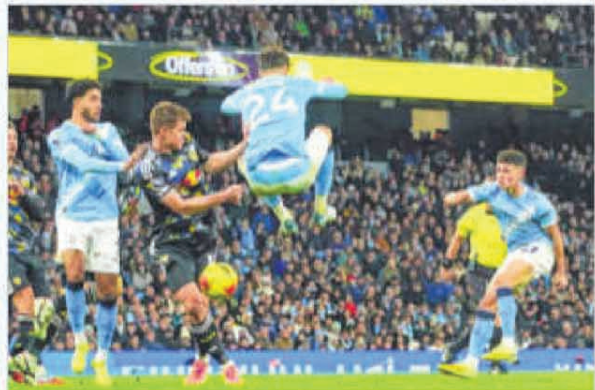
Manchester City's Phil Foden (right) scores against Leeds United.

Brentford and Sunderland proved their straps too in tough games