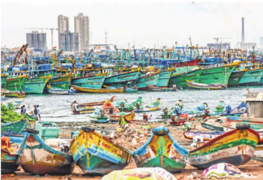
Boats moored at the shore amid gusty winds in view of Cyclone 'Ditwah', at Kasimedu fishing harbour in Chennai on Saturday

There have been no fatalities so far, but 16 livestock have died, and 24 huts have been damaged. "There has been no major impact due to