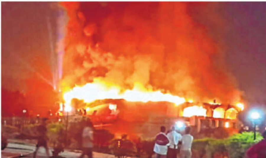
Flames billow after fire engulfed the popular Birch by Romeo Lane nightclub in north Goa on Sunday. The victims included 20 employees of the club and five tourists

packed as it was the weekend, and at least 100 persons were on the dance floor, she said.