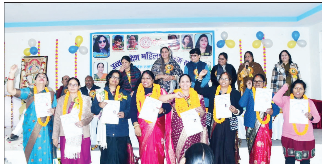
Akhand Bharat Sandesh

Prayagraj. The authorization letter distribution ceremony for the Sahaso Block unit of the Uttar Pradesh Mahila Shikshak Sangh, District Prayagraj, was celebrated with great pomp.