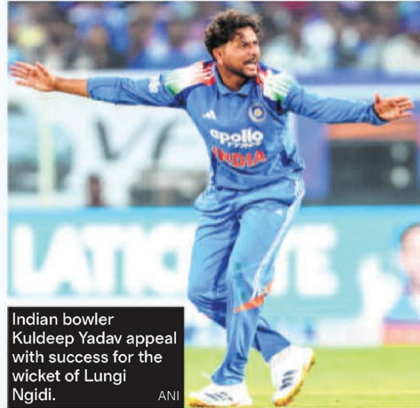
Indian bowler Kuldeep Yadav appeal with success for the wicket of Lungi Ngidi.

Rohit was chuckling as he intervened on at least 3 occasions