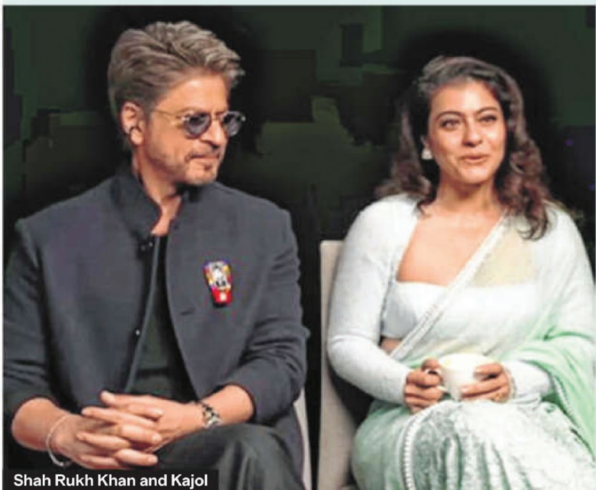
Shah Rukh Khan and Kajol

SRK opens up on James Bond, saying he won't play 007, while reflecting on his journey in action films