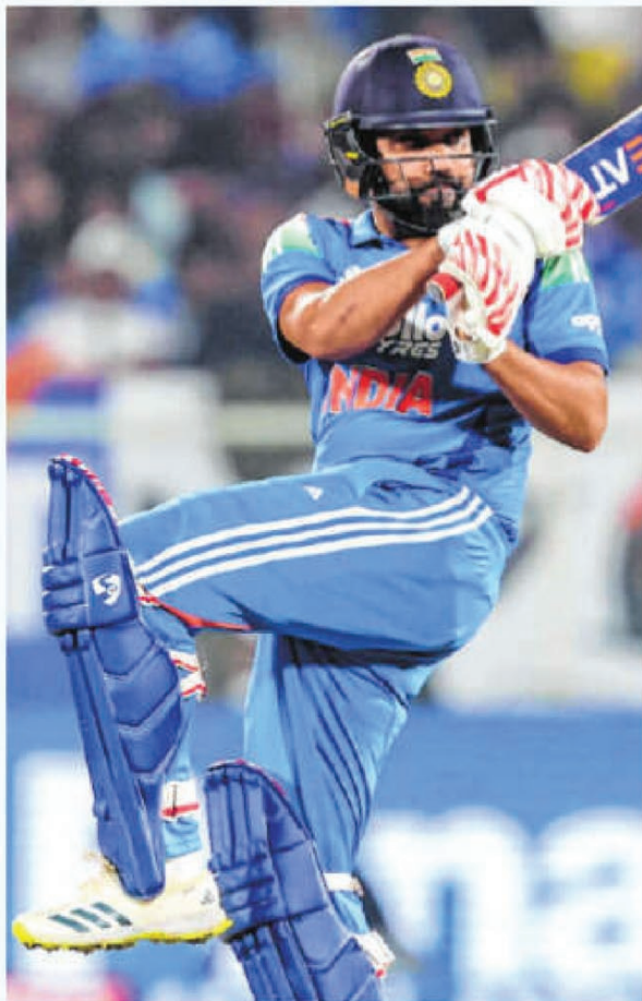
India's Rohit Sharma plays a shot during the third ODI at Dr. Y.S. Rajasekhara Reddy ACA-VDCA Cricket Stadium.