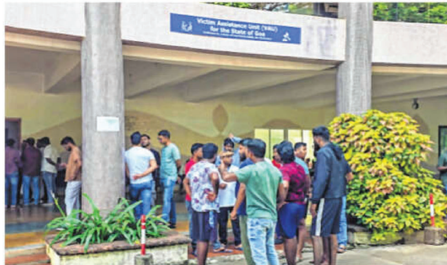
Anxious family members and relatives of victims gather outside Goa Medical College and Hospital at Bambolim in North Goa district on Sunday