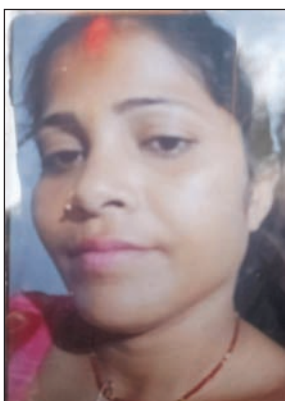
Akhand Bharat Sandesh

Kaushambi. On December 6, in the Sarai Akil police station area, a married woman was harassed