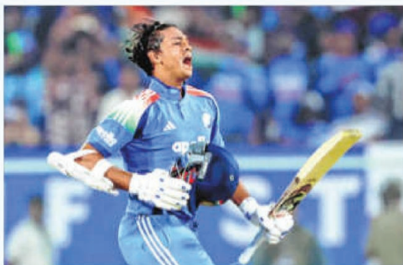
India's Yashasvi Jaiswal celebrates his century during the third ODI against South Africa.