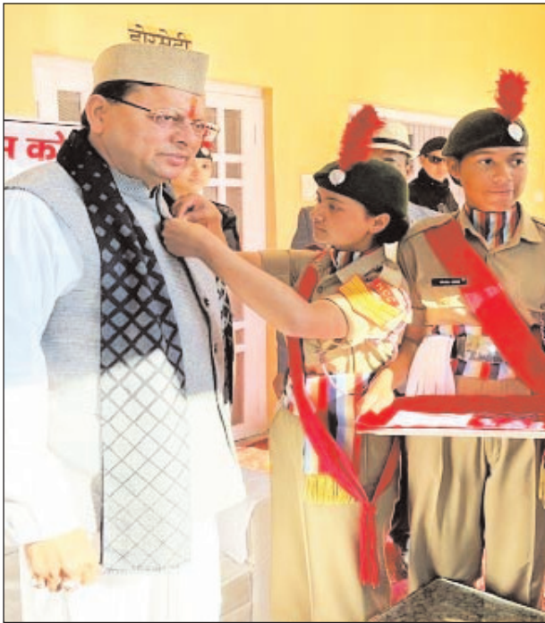
On Armed Forces Flag Day, Chief Minister Pushkar Singh Dhami appealed to the people of the state to contribute.

national song, Vande Mataram. Composed by Bankim Chandra Chatterjee, 'Vande Mataram' was first published in the literary magazine 'Bangadarshan' on November 7, 1875.