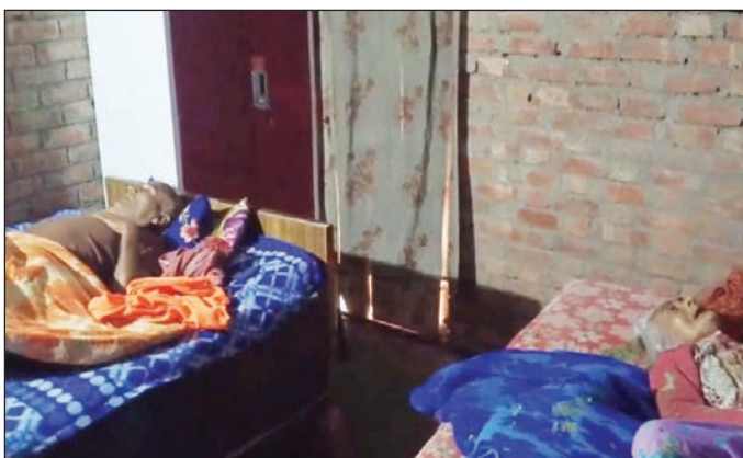
Akhand Bharat Sandesh

Kaushambi. The bodies of an elderly mother and her son were recovered under suspicious circumstances on Sunday afternoon on separate cots inside their home in Barah Haveli Khalsa village, within the Kada Dham police station area. It is suspected that the elderly woman and her son died after being poisoned.