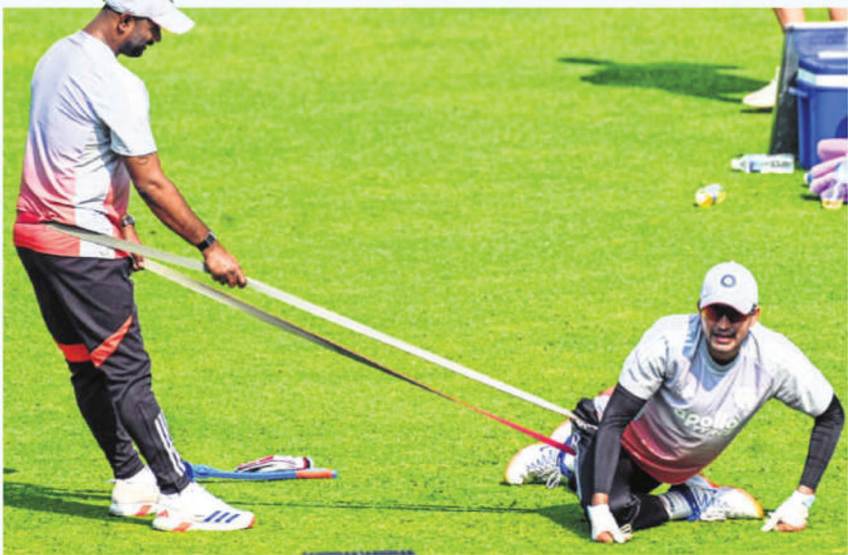
Indian players practice at the Eden Gardens in Kolkata ahead of the first Test.

A support staff member then used a sidearm to deliver throwdowns from height, giving Gill extra bounce and