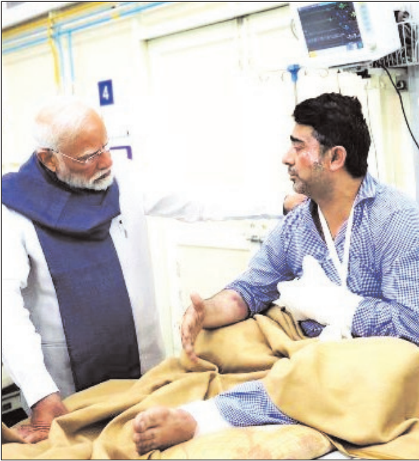
Prime Minister Narendra Modi, returning from a two-day visit to Bhutan, visited LNJP Hospital on Wednesday to meet those injured in the blast near the Red Fort in Delhi. He met with the injured and wished them a speedy recovery. Hospital officials and doctors also briefed him on the condition of the injured.