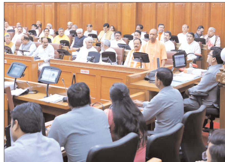
Address of Honorable Chief Minister Yogi Adityanath in the Legislative Council.