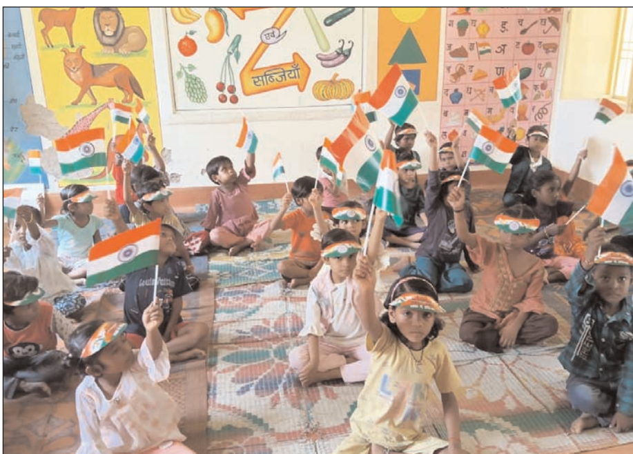
(NEP) 2020, Balvatikas in Uttar Pradesh's government schools are now ready to become a vibrant world of learning .

participants chanted patriotic slogans, echoing a deep sense of national unity and devotion. The initiative is part of a nationwide call to action from 13th to 15th August 2025, involving activities like Prabhakar Pheris, Tiranga rallies, and the popular 'Selfie with Tiranga' campaign. MUNPL Meja remains dedicated to upholding and promoting the spirit of patriotism, unity, and respect for the national symbols.