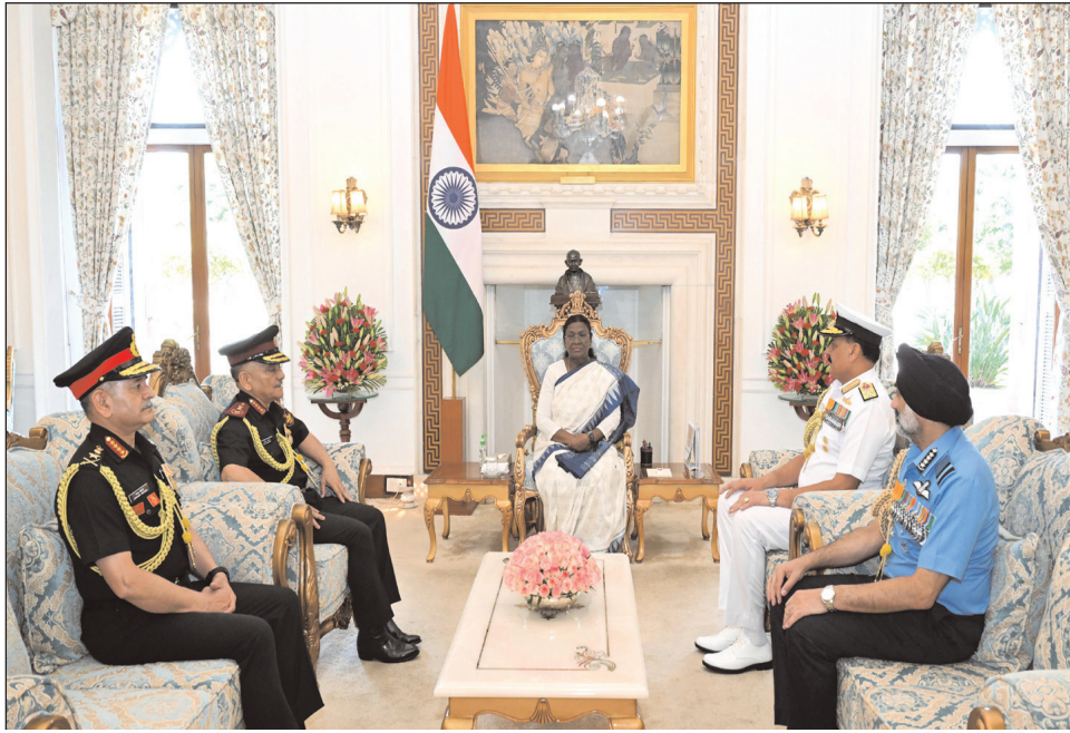
Army chiefs met the President and gave information about Operation Sindoor.

Trump announcing the truce before the India and Pakistan confirmed it has raised several eyebrows over a third party intervention into the matter. Moreover, the US president has repeatedly asserted that the States played a key role in brokering peace between the two nations following their military escalation, even claiming he threatened to halt trade with both nations to prevent further conflict. However, government sources have dismissed these claims, stating that no trade-related discussions took place with US officials since the launch of Operation Sindoor. Despite addressing the nation twice since the ceasefire, Prime Minister Narendra Modi has remained silent on Trump's assertions.