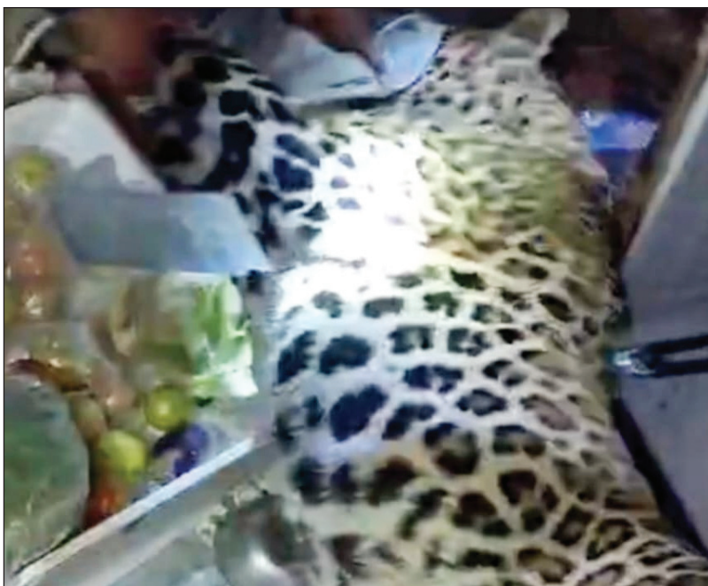
Akhand Bharat Sandesh

After the rescue operation, the Forest Department team tranquilized the leopard with a tranquilizer gun