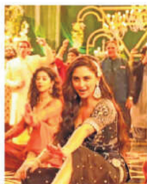
A still from the song

done what they could do best. So, I'm never going to take away from anyone who's hardworking, who's self-made, who has, you know, who has been consistent and is ready to, you know, put in the effort. So, I feel like she's doing big