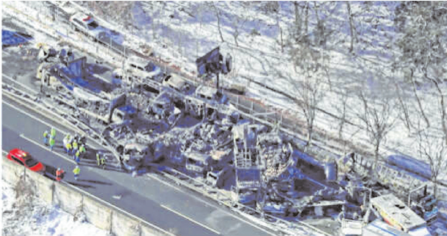
Burnt vehicles are seen after a massive crash on an expressway in Minakami, northwest of Tokyo, on Saturday.

and a charred body was later recovered from the driver’s seat of a burned-out truck, police said. Of the 26 injured, five were in serious condition, police said. A warning about heavy snow was in effect late on Friday, when many Japanese started their year-end and New Year holidays. Parts of the expressway remained closed for police investigation, removal and cleaning of the wreckage.