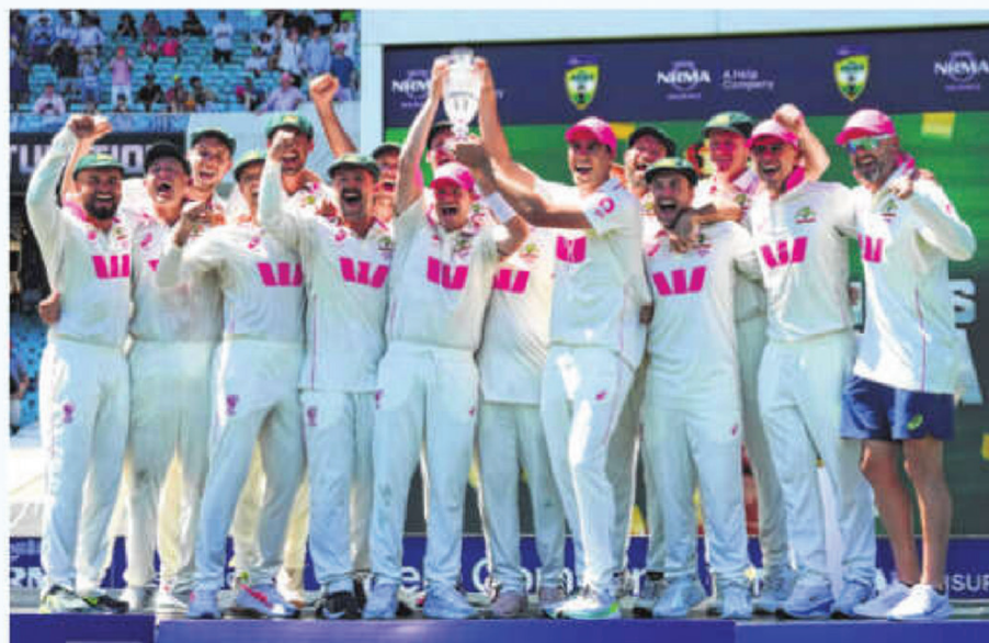
The Australian team celebrates with the Ashes trophy in Sydney on Thursday.

So I am really happy that a lot of Indian girls are going to get to work with her. And pick her brain around how they can get better. And again, on my bowling, I don't think that is another thing," Mandhana said.