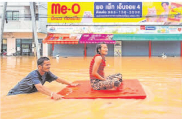
People flee floodwaters in Hat Yai, Southern Thailand