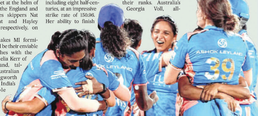
Mumbai Indians players celebrate their win against Delhi Capitals in the Women's Premier League 2025 final match in Mumbai on March 15, 2025.

Mandhana's form isn't something RCB would be too worried about given the immense potential that the 2024 edition winners have in their ranks. Australia's Georgia Voll, all-