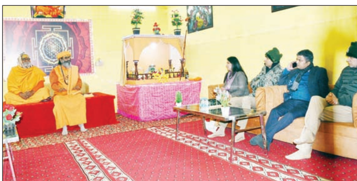
Akhand Bharat Sandesh