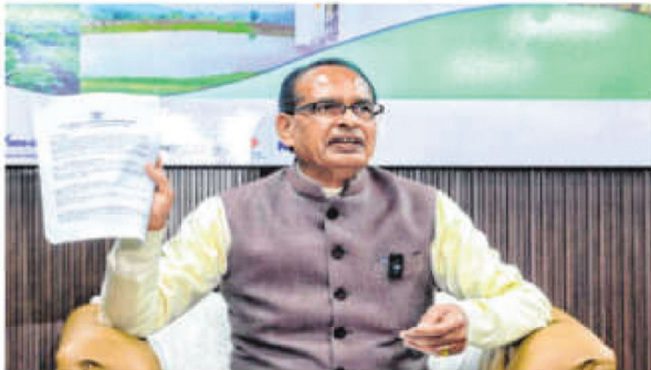
Minister of Agriculture & Farmers Welfare and Rural Development Shivraj Singh Chouhan addresses media on VB-G RAM G Act, 2025, in New Delhi on Monday

Since then, the MGNREGA has generated more than 180 crore days of work, created