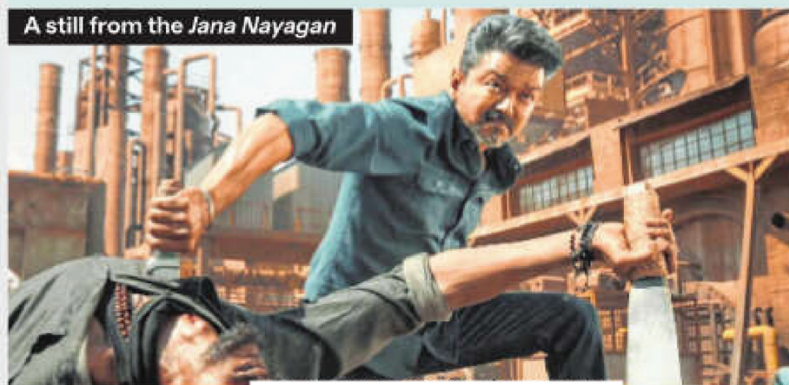
A still from the Jana Nayagan

The trailer showcases Vijay performing high-octane action sequences, including fights with an axe. In the final moments, he looks straight into the camera and declares, "I am coming," giving a fresh twist to his iconic line, "I am waiting."