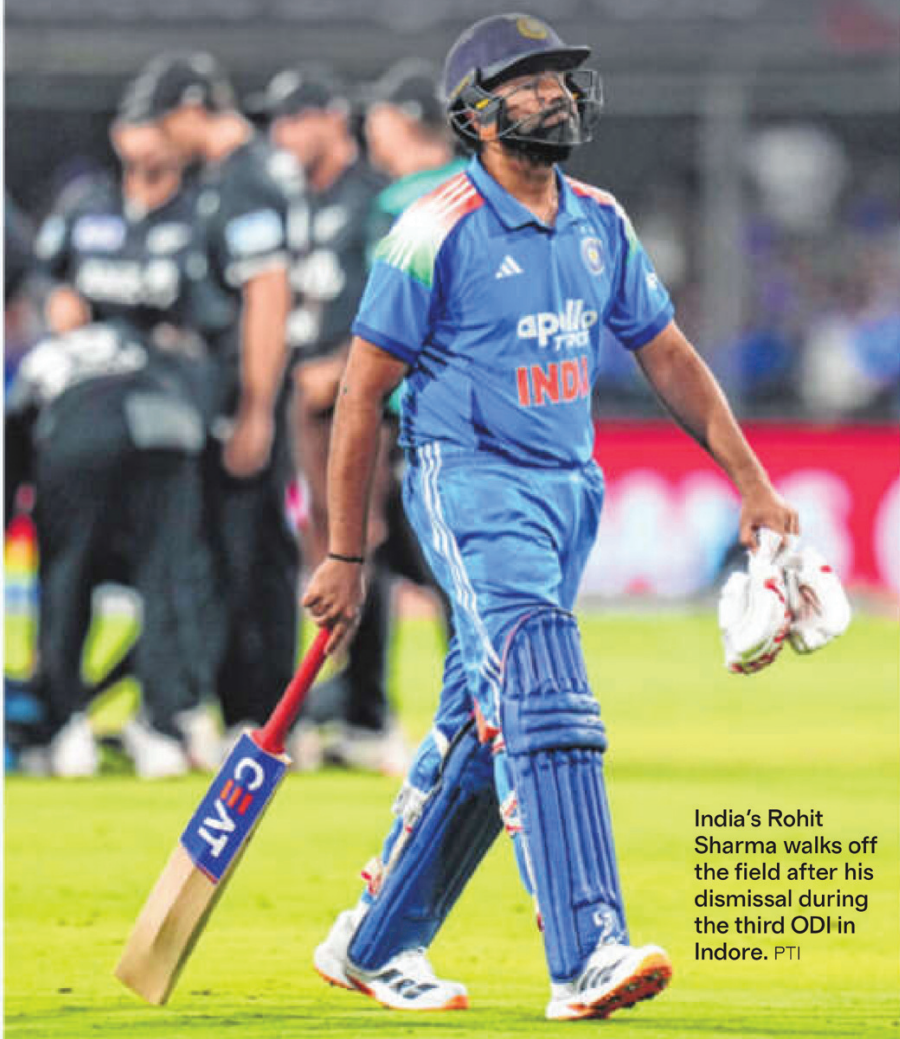
India's Rohit Sharma walks off the field after his dismissal during the third ODI in Indore.

to consistently convert the starts we were getting. On pitches like these, if you don't make those starts count, you're always chasing the game."