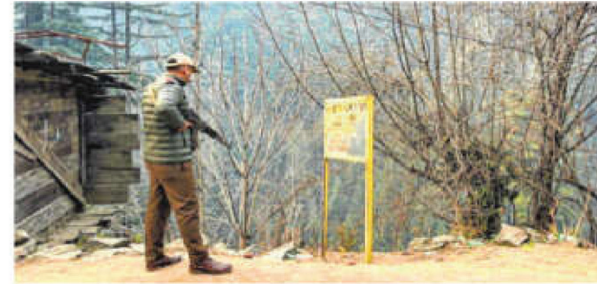
A security officer during a search operation to track down and neutralise terrorists, in Kishtwar district, Jammu and Kashmir, on Monday

The operation was launched in Sonnar village near Mandral-Singhpura in the Chatroo belt on Sunday, where an encounter broke out between the forces and terror-