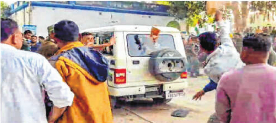
BJP and TMC workers clash over the submission of Form 7, objecting to the inclusion of voters, as part of the SIR, in West Bengal's Murshidabad district on Monday

The court directed that the director general of police (DGP) of West Bengal shall be obligated to ensure that there is no law-and-order problem