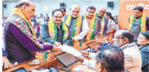
BJP President JP Nadda, Union Ministers Amit Shah, Rajnath Singh, Nitin Gadkari and Kiren Rijiju proposing the name of Nitin Nabin for BJP chief at party headquarters in New Delhi on Monday

national president JP Nadda and several union ministers, including Rajnath Singh, Amit Shah and Nitin Gadkari, accompanied Nabin to the office of BJP's national returning officer and MP K Laxman for the filing of his nomination.