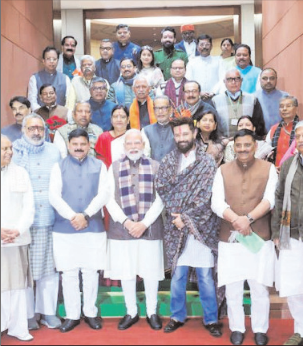
After the huge success in the Bihar Assembly elections, Prime Minister Narendra Modi met with Bihar NDA MPs in Parliament

song after the Muslim League's opposition. He added that Nehru, following Muhammad Ali Jinnah's statement against the song in 1937, described the song as irritating to Muslims. He men-