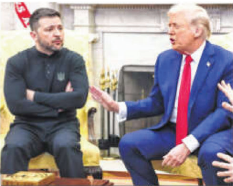
US NOT IDIOT WITH CHEQUEBOOK

The comment came after several days of talks between US and Ukrainian officials wrapped up on Saturday (Dec 6) without any major breakthrough. Zelensky,