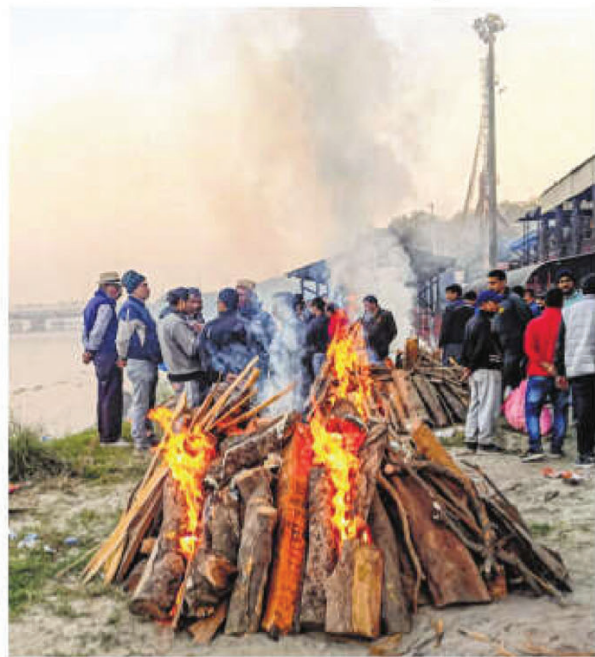
Relatives stand around funeral pyres during the cremation of victims of the Goa nightclub fire at Nigam Bodh Ghat Crematorium in New Delhi on Monday

All urban local bodies have been instructed to identify suspected foreign nationals and prepare lists. He said that illegal occupants put a burden on public resources and hamper welfare benefits meant for the poor. A special document verification campaign is underway to detect infiltrators and send them to detention centres for further legal action. Detention facilities are being established in every division to support the process.