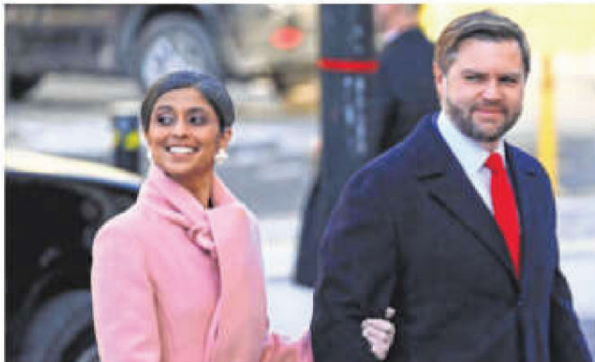
Vice President JD Vance and his wife Usha Vance

Social media users accused Vance of inconsistency, with