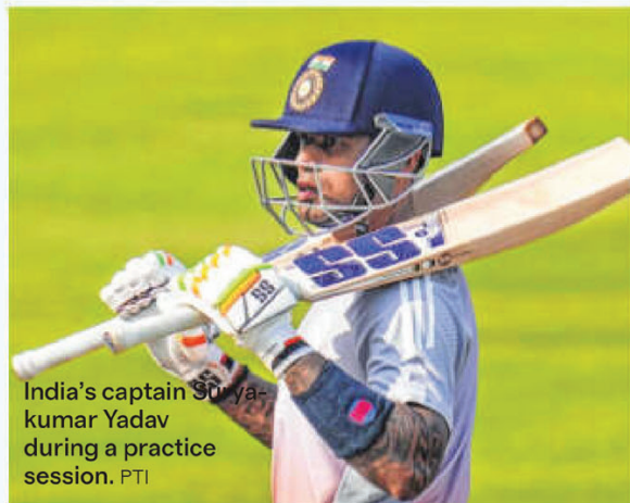
India's captain Suryakumar Yadav during a practice session.

"Right now, both of them look healthy and fit," he said.